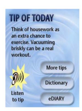
Fig. 3. Screenshots of nutrition summary and tip of the day. The nutrition summary is presented automatically after each food entry, and the tip of the day can be accessed from the main menu.

5) Integrating Two Tools in One (E): Because the eDiary program can run on a mobile phone, the user does not need to carry an extra device. The user may choose to use the "Easy Health Diary" application or the ordinary phone screen as the main interface, accessing all functionalities in either case. When the diary is used as the main interface, the phone is accessed by activating the lower right button "Phone". If the phone is used as the main interface, the diary is reached by activating an "eDiary" button