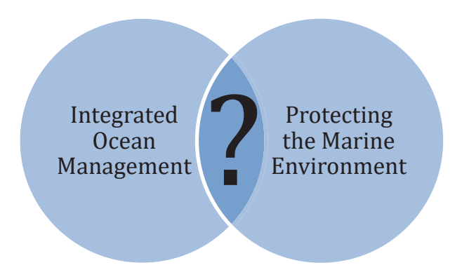
Figure 1: Simple Venn diagram illustrating theme relationships and the overlap to be investigated by this dissertation.

Essentially, this research question concerns three themes: (1) Disentangling and structuring abstract and practical variants of IOM; (2) Identifying ways of approaching and concretizing protection of the marine environment as a management objective; (3) How to assess the contribution of IOM to protection of the marine environment. These themes capture concepts, objectives, and problems that are important premises for law and governance of the oceans.<sup>29</sup> The relationships between the three themes are illustrated in Figure 1.