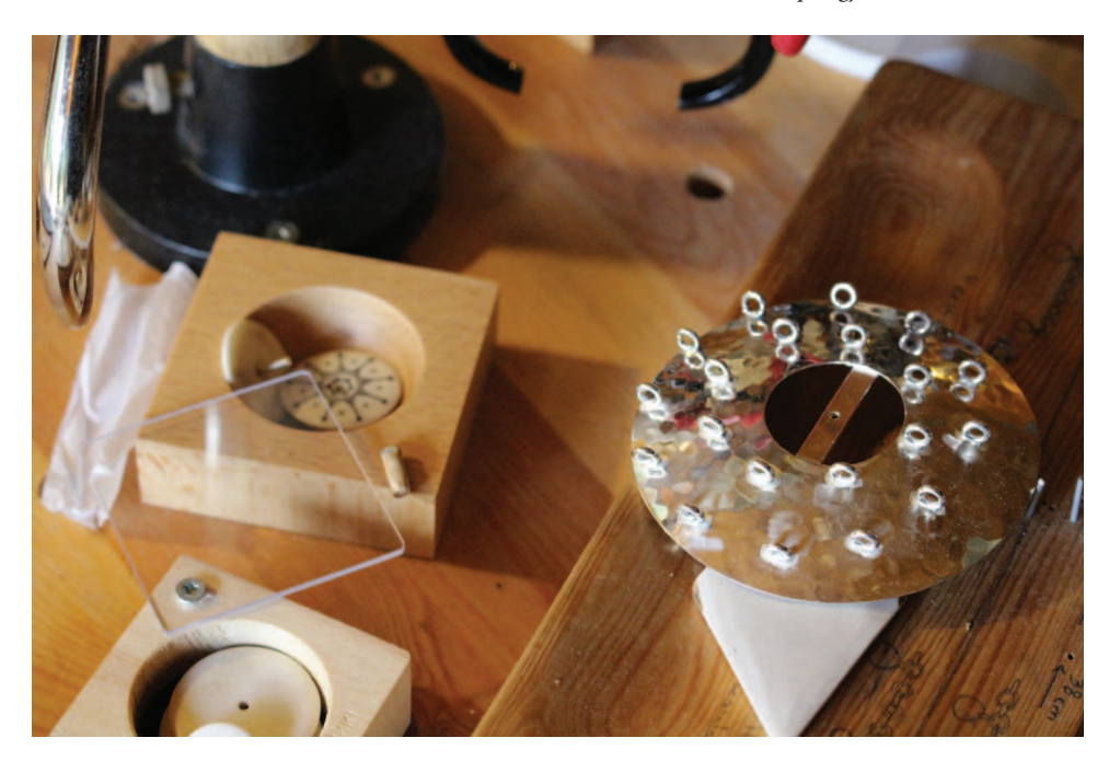
Figure 3. Silver frame of the solju awaits dangling pieces of silver and the engraved antler inlay in the wooden box.

Meanwhile, the knowledge of collection and working requires teaching by older generations, so the communication generated through production acts as a mechanism for reforming ties to people and natural resources alienated by state