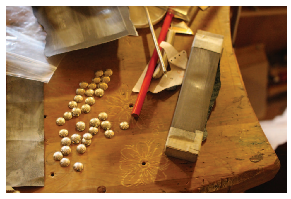
Figure 1. Silver buttons with the signature Laiti design on the worktable at Samekki.