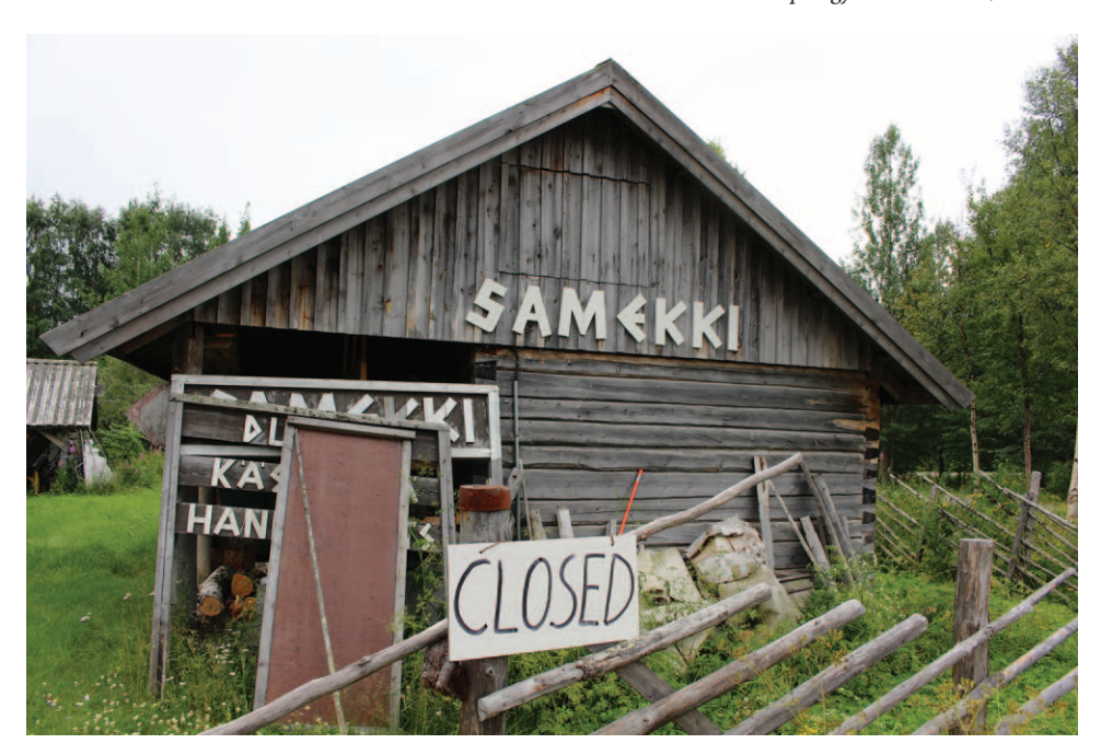
Figure 5. Samekki workshop closed for several years after our time there.

formal occasions in everyday life, she mobilizes its material properties of wool broadcloth as a second skin. She makes and wears the gákti every day for one year not only to decolonize her own bodily practice but also to break down racialized representations of Sámi that create obstacles to Indigenous rights. She explains, "It was my idea to decolonize my closet because I don't have dark skin all the time, I have really white skin all the time. And people mess up that I'm not Sámi. . . . I wanted to show that my mind is not white, that my father is not white, my mother is not white. And then I got the idea that I have the skin, my own skin."