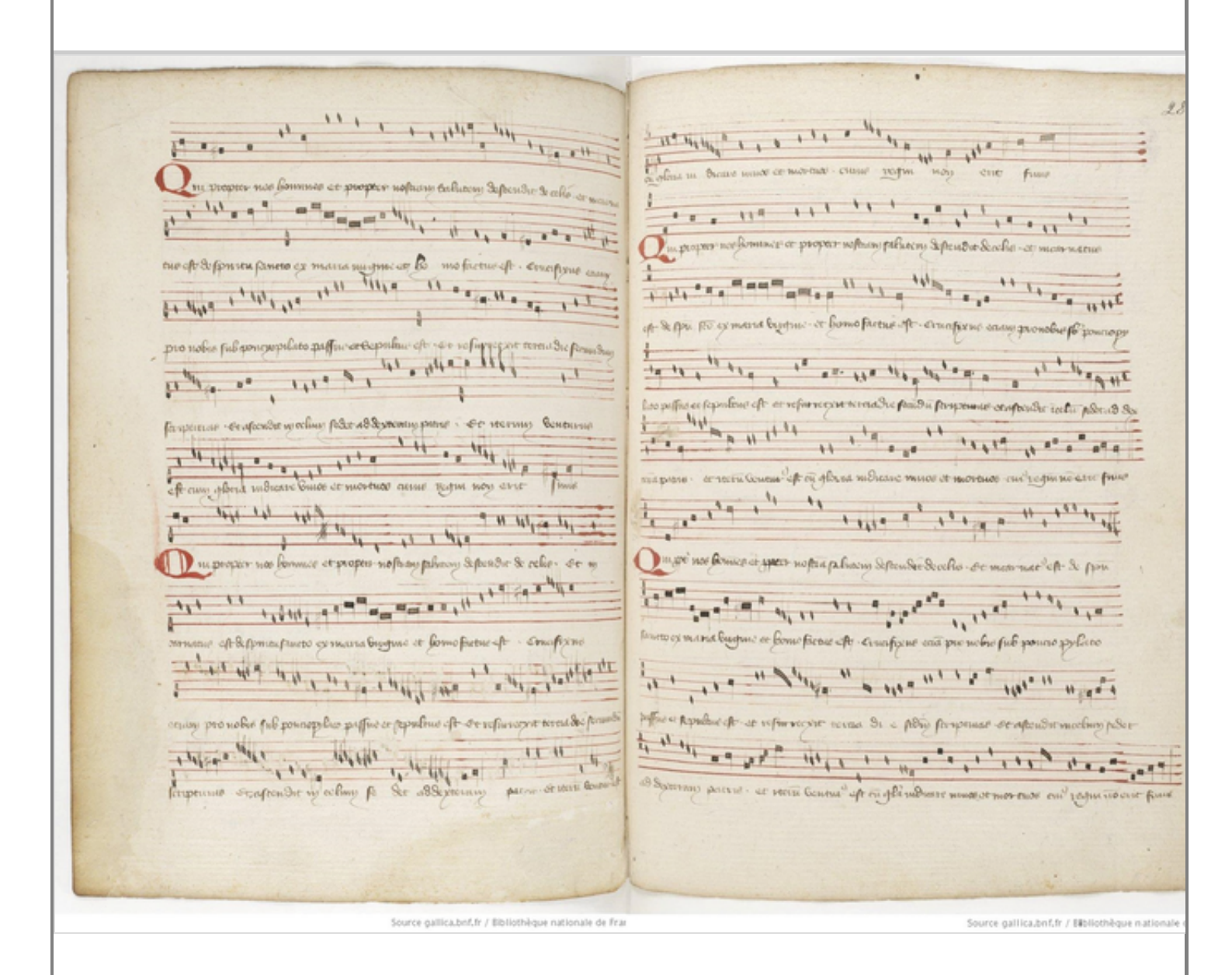
Fig. 7.5 F:Pn 1585, ff.287 v –288 r : extract from the Credo

I wish to take one more example of the same passage, this time from manuscript F:Pn 1584 (Fig. 7.6), to show how even in a manuscript such as this where the text-music relations are generally clear (this manuscript may well have been made within Machaut's purview, and it displays considerable concern for the transmission of the works), the anchor points can nevertheless help resolve difficulties. On the fourth staff of the tenor part (counting from the left, the third column of the opening), the word-text alignment is unclear during and immediately after the longs, due to some erasures. Indeed, one erasure too many, for, by looking at the placement of the longs over the corresponding text in the other parts, and knowing that all parts move together at this point, the reader can re-establish the erased note that corresponds to the last syllable of 'virgine'. On this same opening, the untexted rhythmic sequence in the tenor and contratenor after the word 'patris' can also be seen. Its untexted nature allows it to sit in the margin of the counteratenor part: a necessary means of saving space on a crowded staff, perhaps, but also a vivid visual reminder of the sonic flourish which these notes represent.