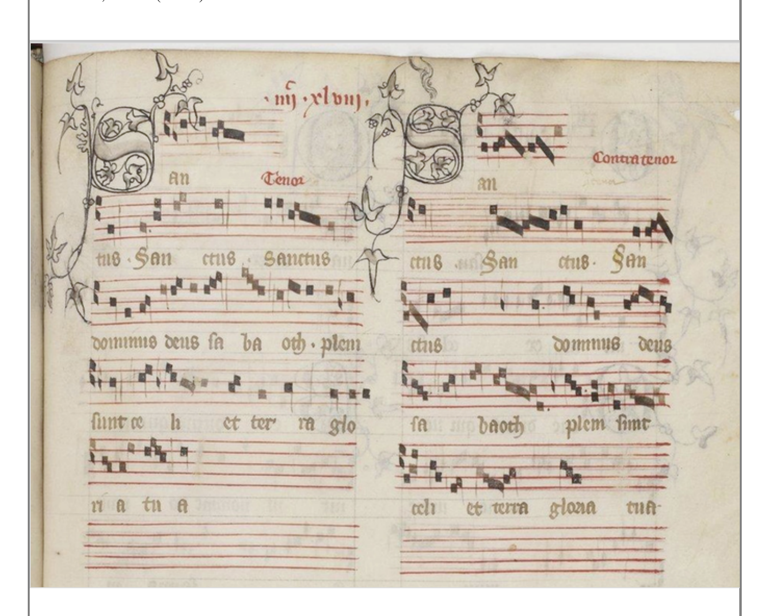
Fig. 7.2 F:Pn 1584, f.448r (detail): the tenor and contratenor from the Sanctus

A more extreme example of this separation of words and music can be seen in F:Pn 1585. This manuscript is for the most part a copy of GB:Cccc Ferrell-Vogüé, and a study of the two together offers further insight into the workings of the scribal mind. Whereas for the majority of the time the layout of the page is identical between the two manuscripts, in Fig. 7.3 the text is written one staff lower in F:Pn 1585 than in