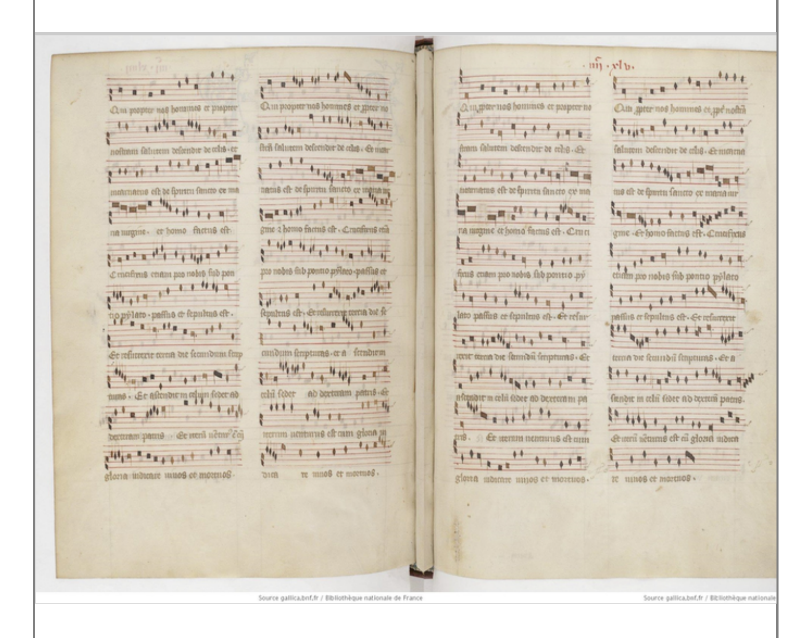
Fig. 7.6 F:Pn 1584, ff.444 v –445 r : extract from the Credo

As my final discussion point, I shall move from small details to a larger issue of page layout: page turns. Of the five surviving versions of the mass, four present their page turns at the same points. Where these points are divisions between movements this is unsurprising; the fact that the turns occur at the same points in the longer movements, particularly given that one of the manuscripts, F:Pn 9221, is in a much larger format than the others and thus sacrifices much space (including an entire empty page in the middle of the Credo), requires some pause for thought.