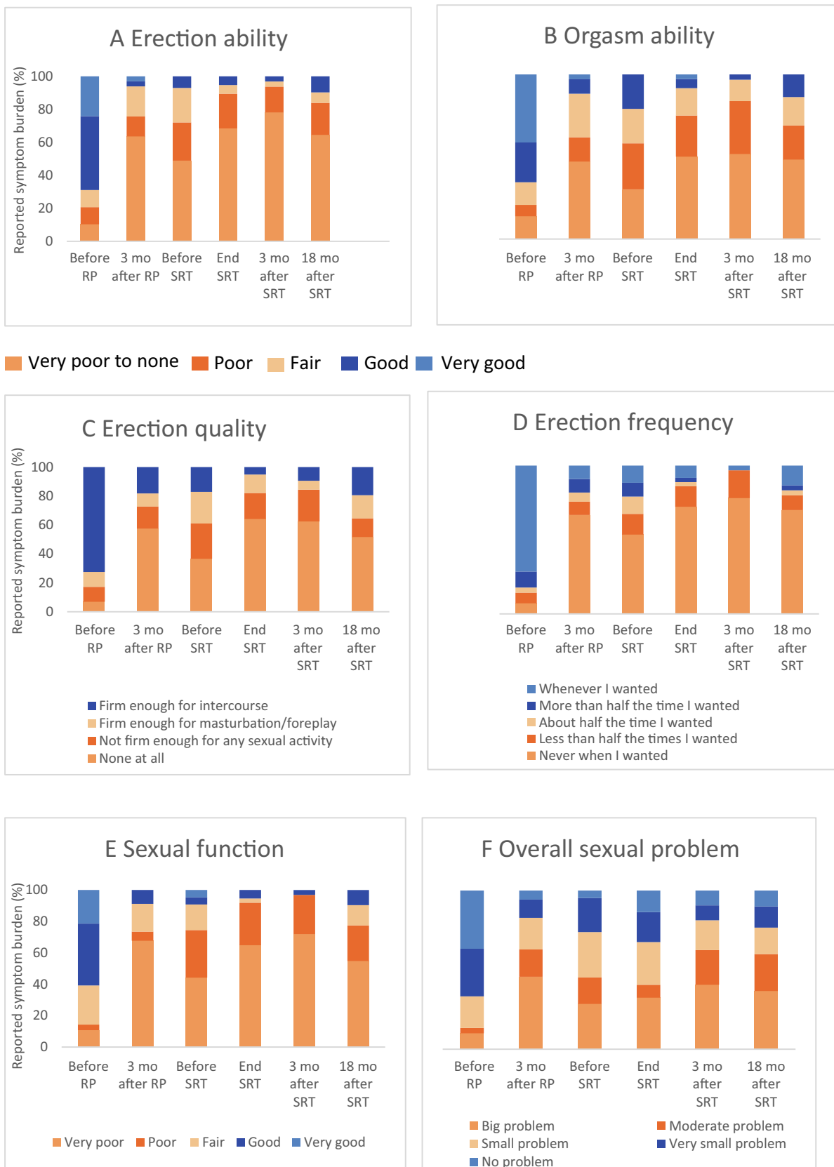
Fig. 3 – Distribution of reported severity of sexual functional problems for the subcohort (n = 48) according to time. The darkest orange color represented the most severe symptom, and dark blue represented the least severe symptom. RP = radical prostatectomy; SRT = salvage radiation therapy.