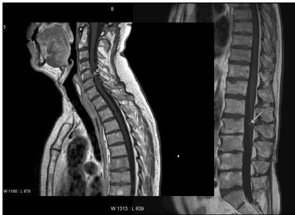
Figure 3 Magnetic resonance imaging (T1-weighted post Gadolinium) showing two of several contrast-enhancing leptomeningeal metastases, indicated by white arrows.