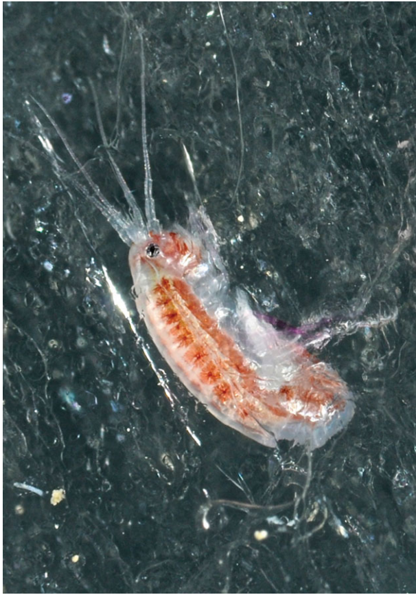
Figure 1. In situ Apherusa glacialis from sea-ice.