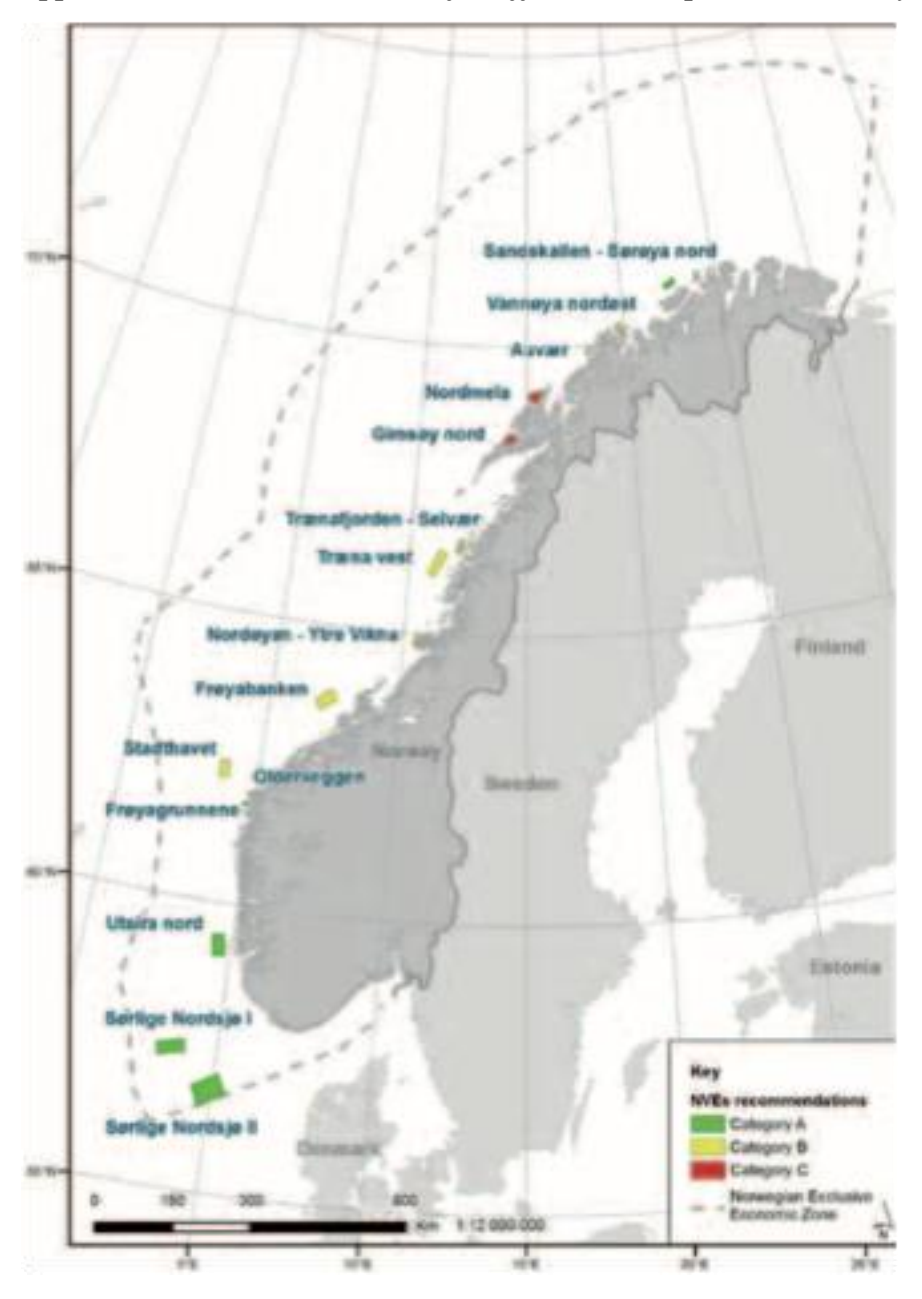
Appendix II – Zones considered for offshore wind power in Norway<sup>482</sup>