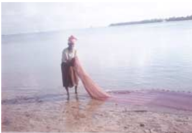
Figure 4: An old woman collecting uduvi at Mbegani Beach