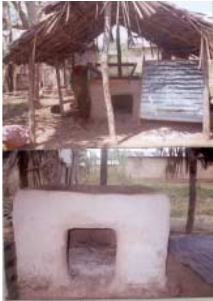
Figure 1: Fish smoking using muddy oven at Bagamoyo