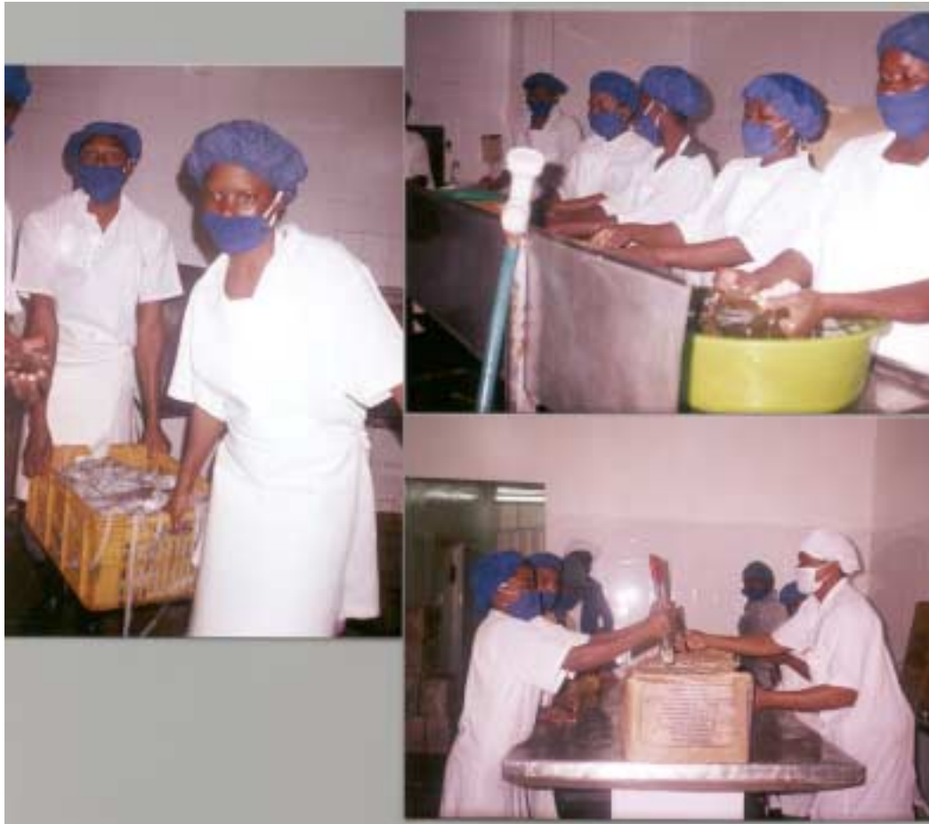
Figure 8: Women in the processing job at TANPESCA plant