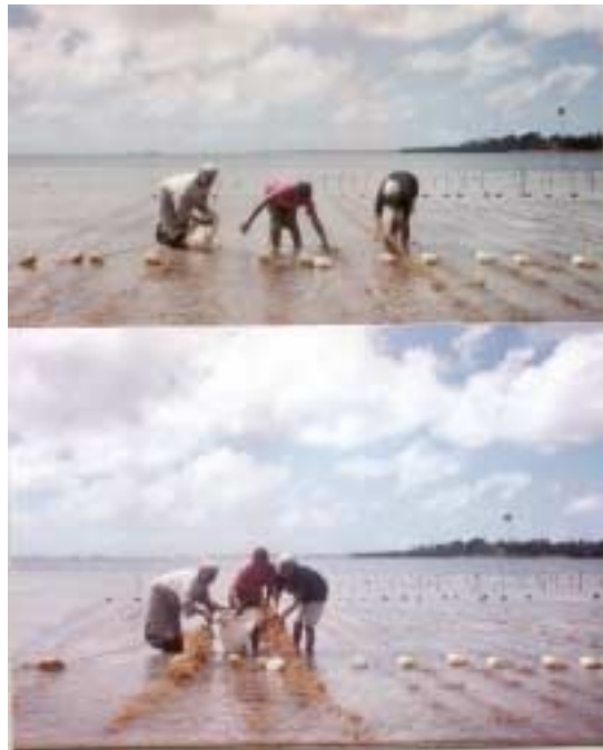
Figure 6: Women offloading octopus and processing at the beach of Jibondo Figure 7: Women seaweed farms at Jibondo and Juani Villages