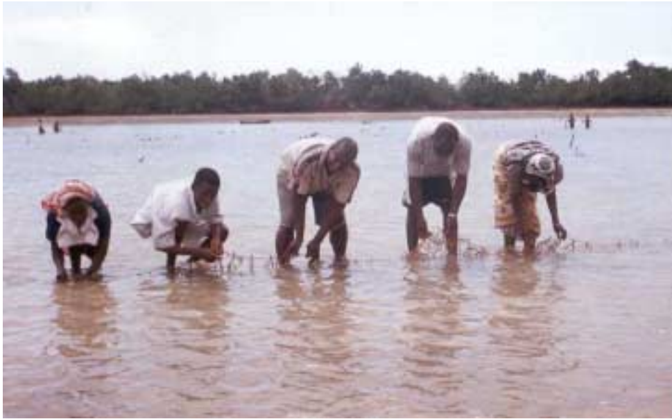
Figure 5: Women and men working in seaweed farm at Mlingotini village