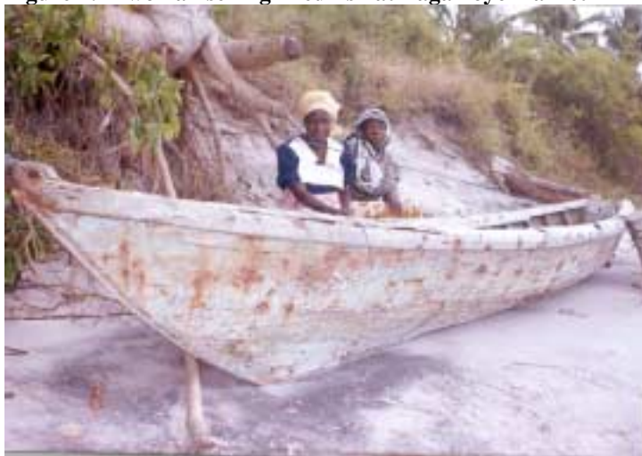
Figure 3: A boat made at Mbegani FDC for Mlingotini women in 1980s