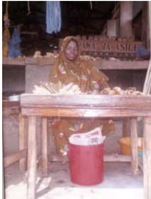
Figure 2: A woman selling fried fish at Bagamoyo market