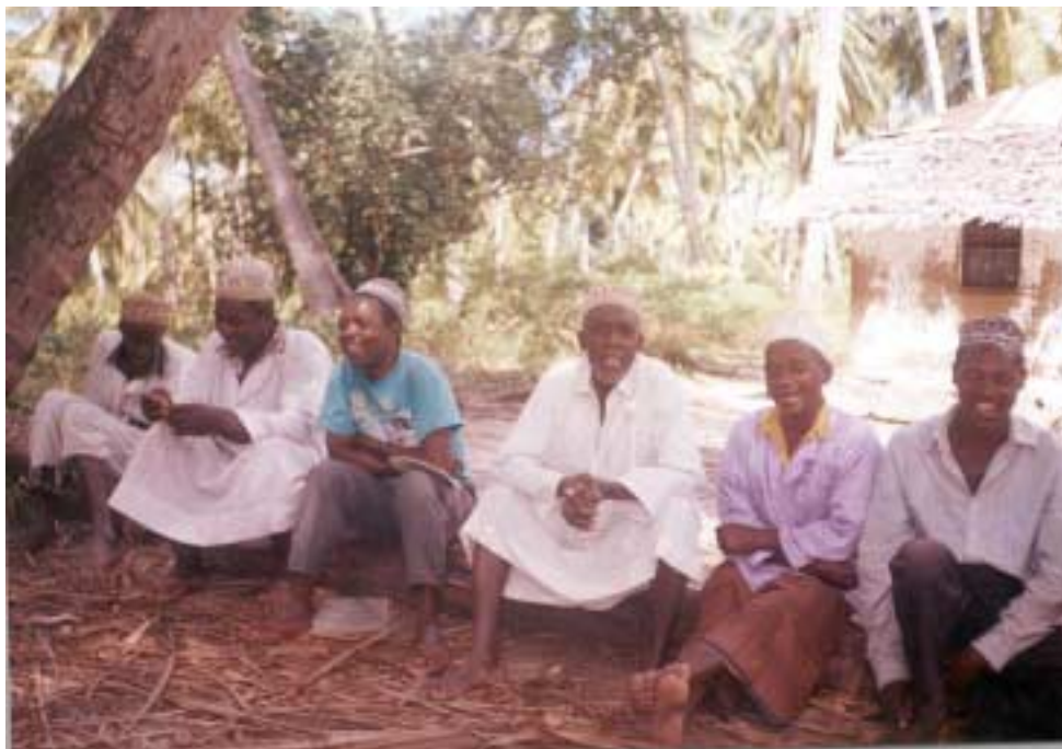
Figure 9: A farming group of men at Kifinge village in Mafia