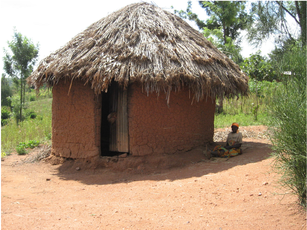
Fig.3 A grass-roofed hut for a returnee woman in Bugabira