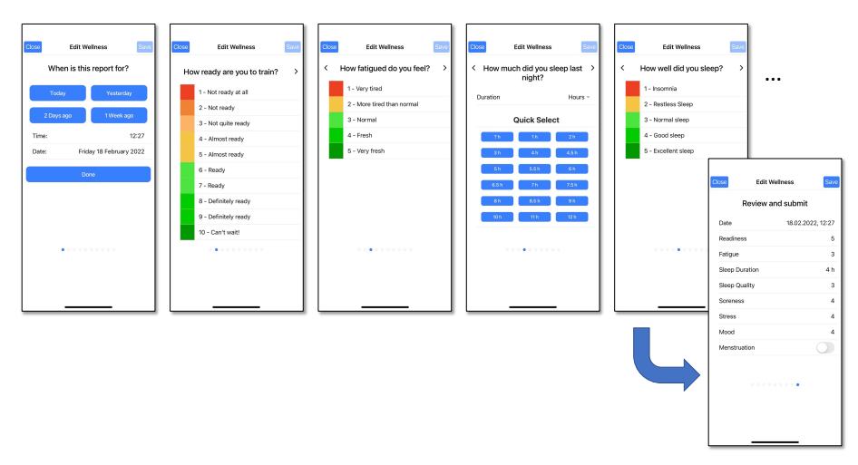
Fig. 3: Subjective parameters logged using PMSys, exemplified by wellness.

major injury or pain. To ensure timely reporting, PMSys sends scheduled push notifications directly to the participants' smartphones. All data was extracted at the end of the logging period from the system into CSV files.