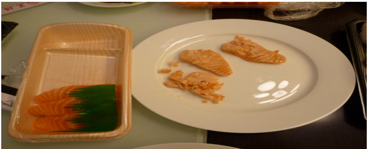
Picture 4. Raw and cooked Norwegian fresh chilled salmon fillets