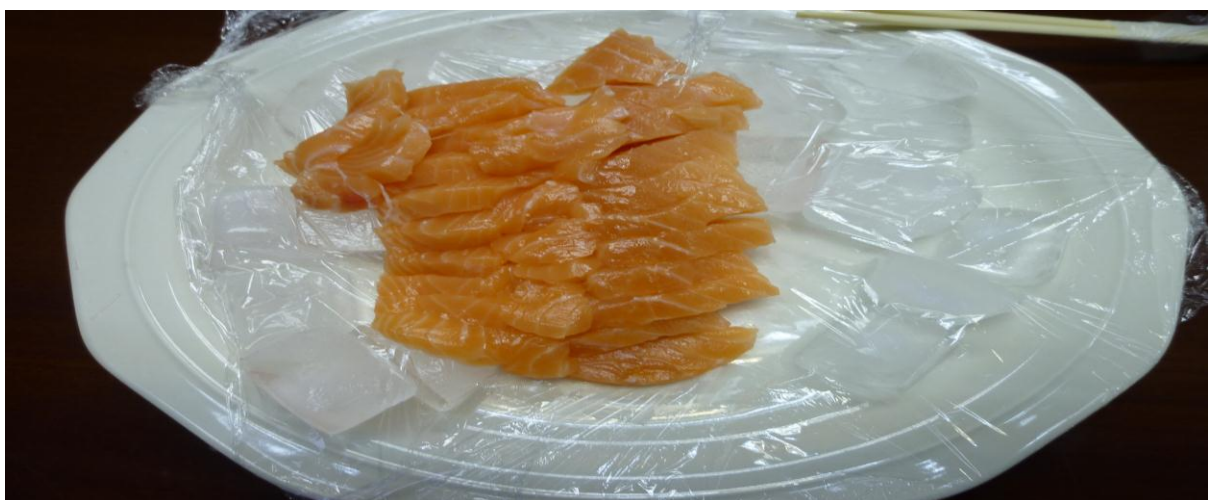
Picture 2. Raw Coolnova salmon fillets