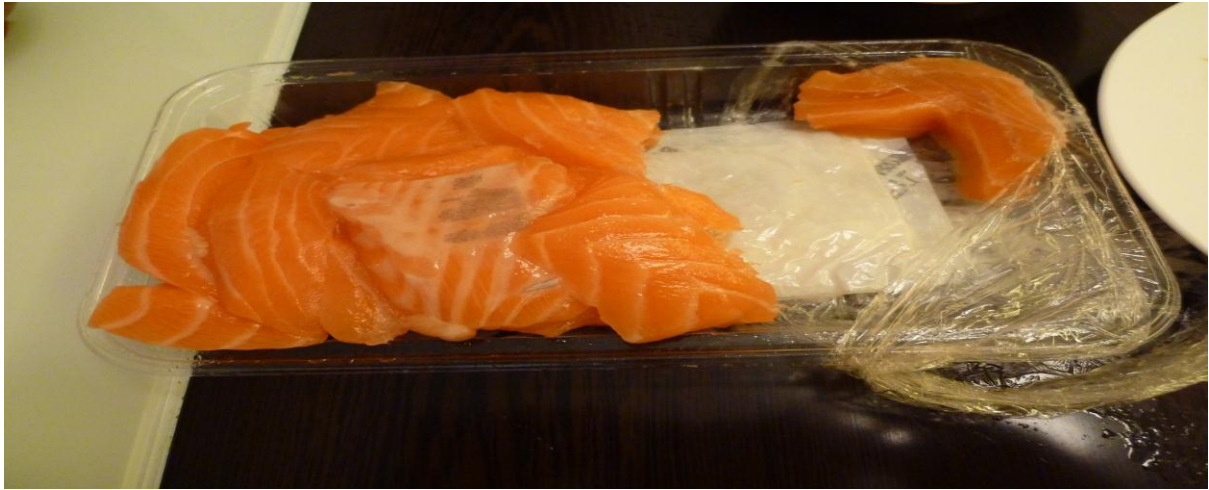
Picture 3. Raw Norwegian frozen salmon fillets