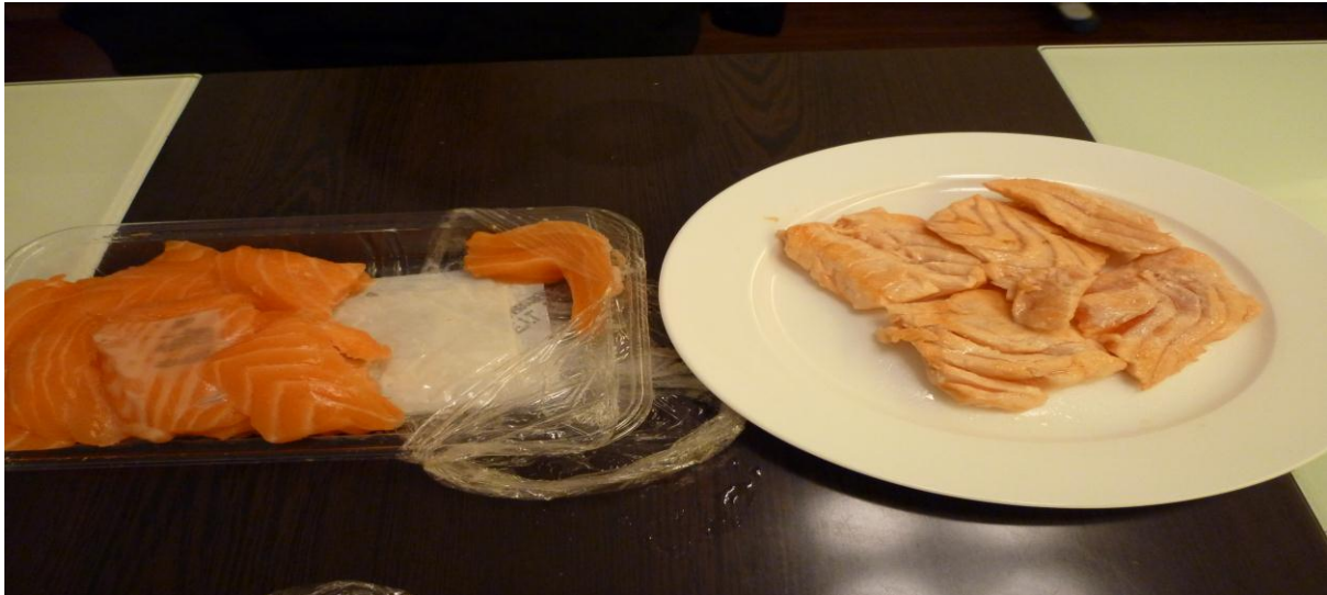
Picture 6. Raw and cooked Norwegian frozen salmon fillets