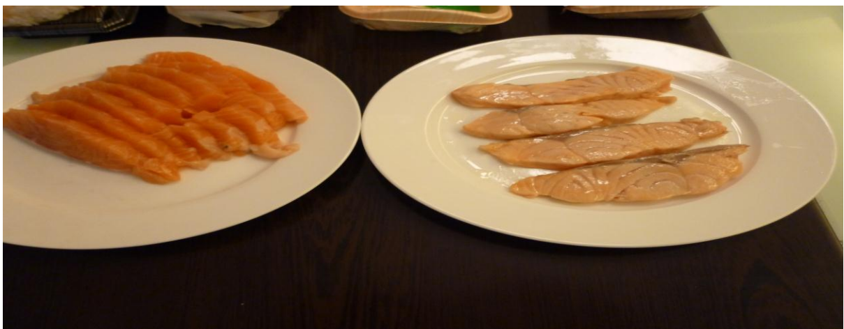
Picture 5. Raw and cooked Coolnova salmon fillets