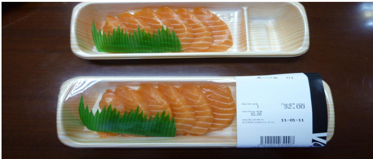
Picture 1. Raw Norwegian fresh chilled salmon fillets

The following pictures are the pictures of the three salmon samples which were used in this research.