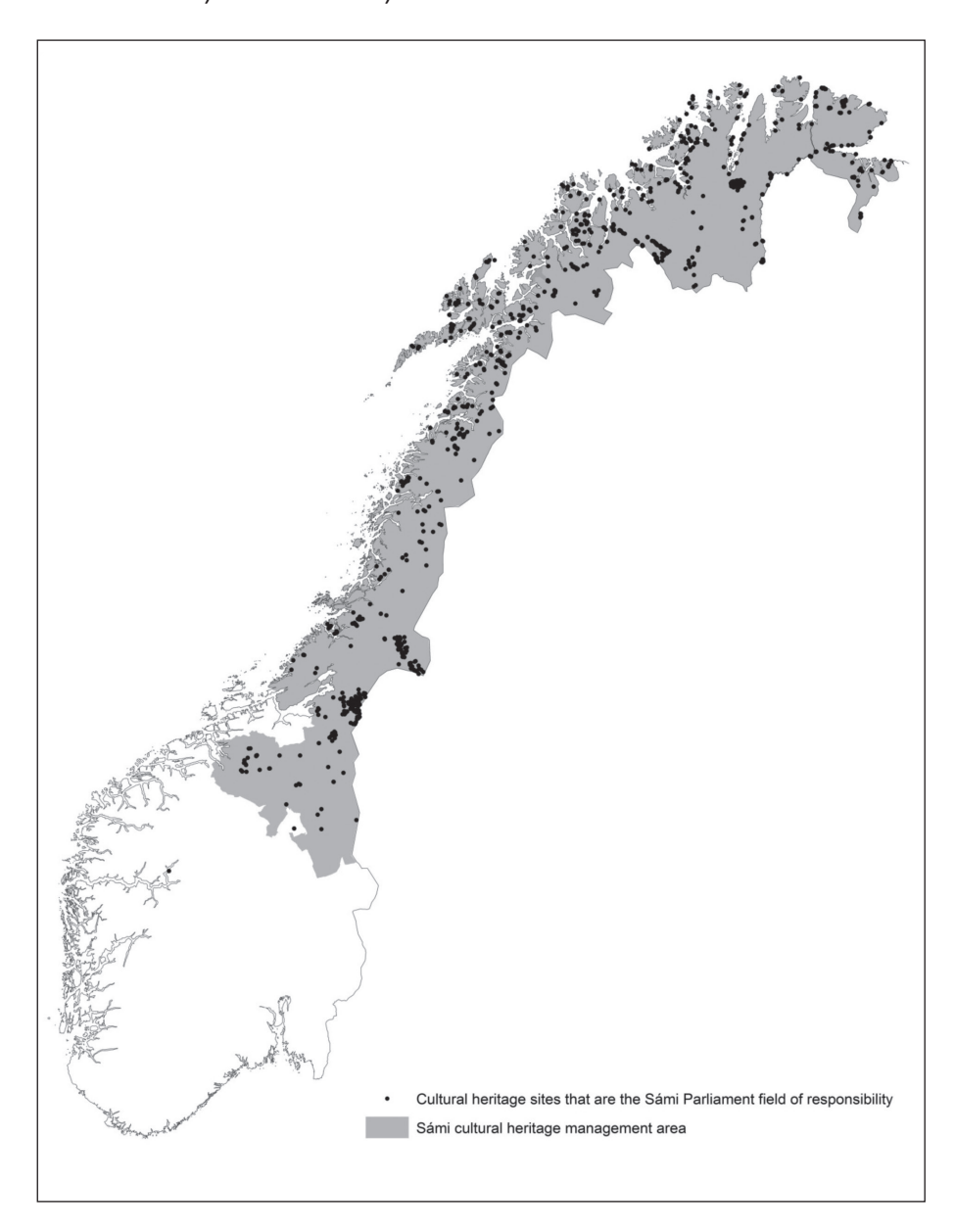
Figure 2: Sámi cultural heritage sites specified in Askeladden as the Sámi Parliament's responsibility. In 2008 there were registered 1746 such localities. Data downloaded from Askeladden in week 36, 2009. Map data: The Norwegian Mapping Authority (Map: Alma Thuestad).