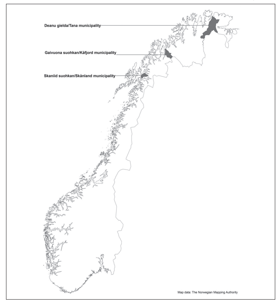
Figure 3: Chosen municipalities (Map: Alma Thuestad).

Among the representatives from the three municipalities there was a general consensus that a fixed limit for the automatic protection of Sámi cultural heritage sites