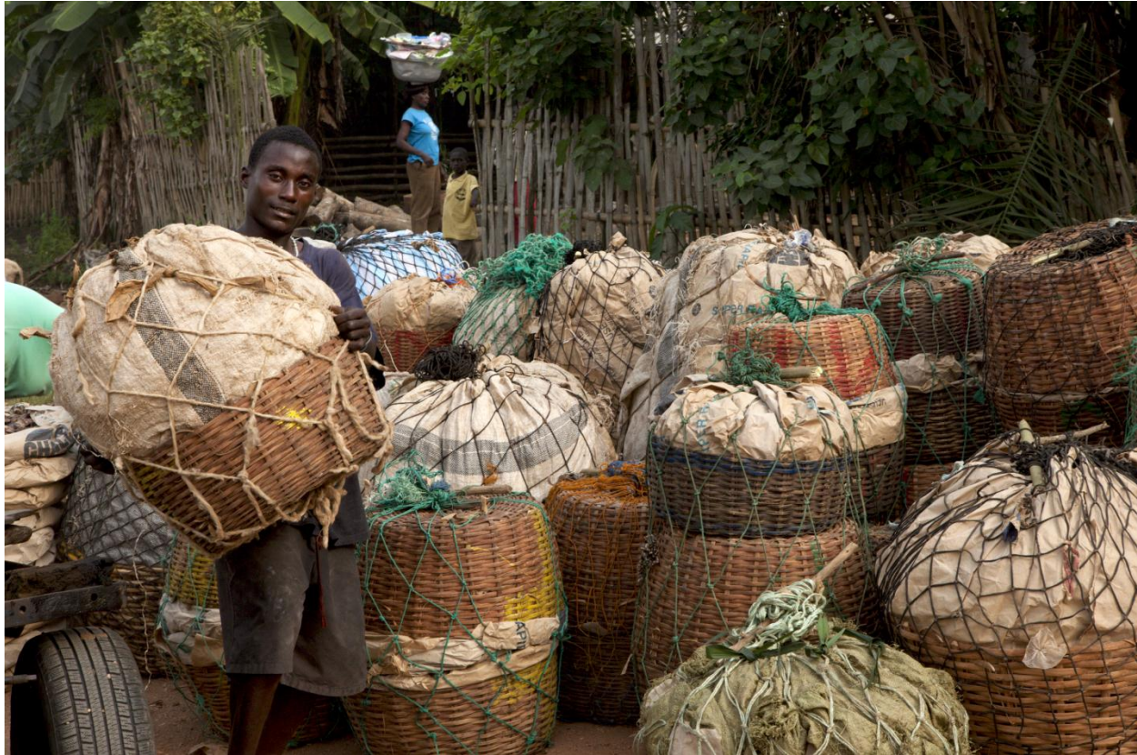
Figure4.1: Smoked fish packaged ready for marketing (field visit, 2012)

Mostly, smoked fish processors sell their products at the fish marketing centers, and the major fish marketing centers are Ainyinasi, Ellubo, and AgonaNkwanta, fish markets just to name a few.