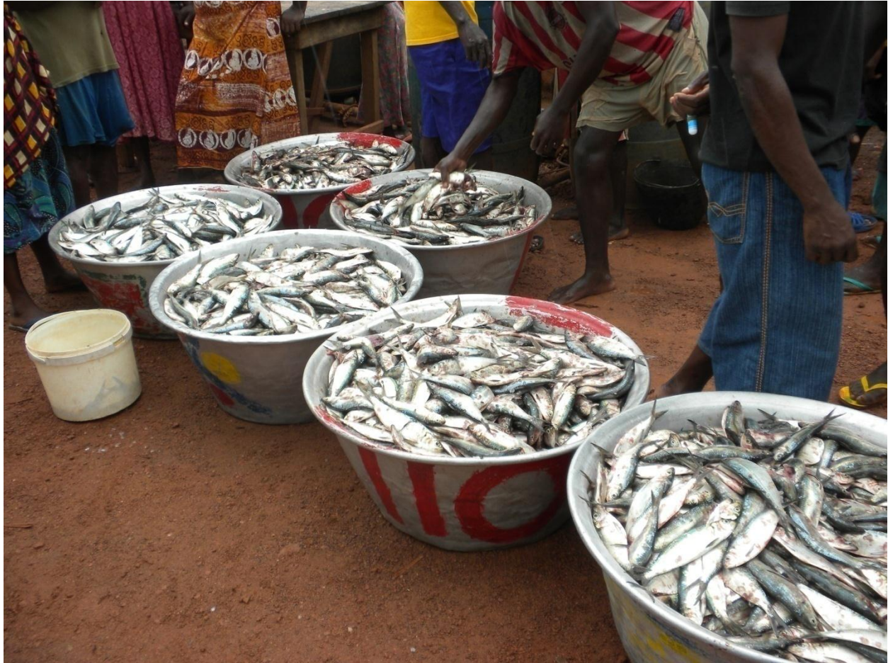
Figure 3.4: Fresh fish sold in basins outside the coastal area of the Nzema East district (Field survey, 2011).

Anytime experimental test is being ran to test the effect of each fuel wood on the quality of smoked fish, a basket full of fresh fish would be purchased, and ten baskets of fish were purchased to run ten separate tests involving ten separate fuel woods.