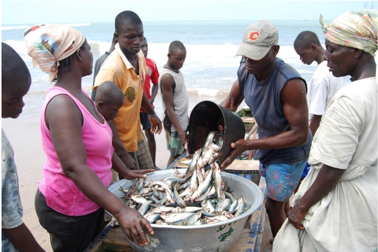
Figure 3.3: Local fishermen selling fish to the smoked fish processors in a measured blue bag (Field visit, 2011)

After acquiring a head load of each fuel wood species, two chorkor kiln ovens with a one tier tray each were secured from Eduku Nyanzu's smoked fish processing unit for the experimental exercises. Each of the chorkor kiln oven had two separate combustion chambers for smooth and easy fire set so that two different fuel wood species could be experimented in a day. The experimental test lasted for 5 days.