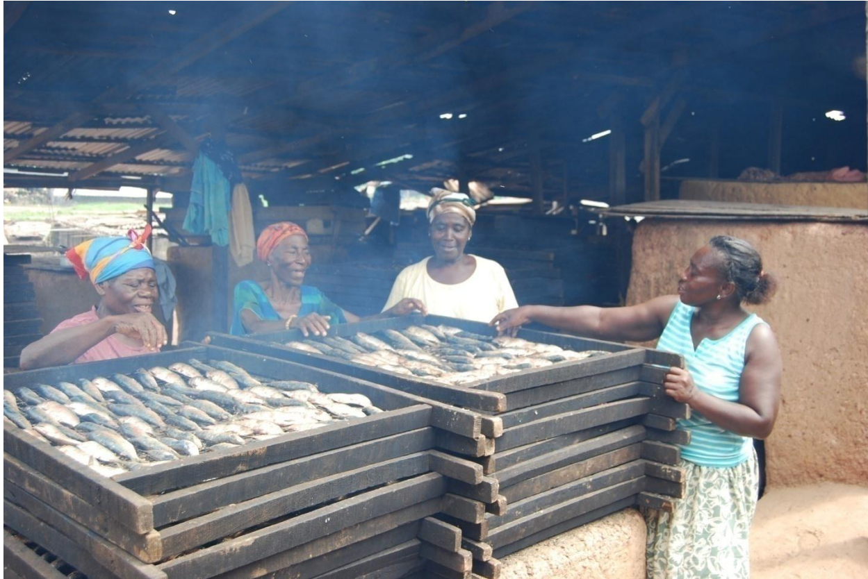
Figure3.5: Fish packed on tier of chorkor trays for smoking (field visit, 2012)

Normally, fresh fish packed on ten tier trays chorkor kiln oven can be smoked for a maximum of 8 hours at an hourly turning interval depending upon the nature of the fish species and the texture of the fish in order to achieve the golden or dark brown colour Ikenweiwe, (2010), but that was not the case during the experimental test due to the number of the tier kiln oven.