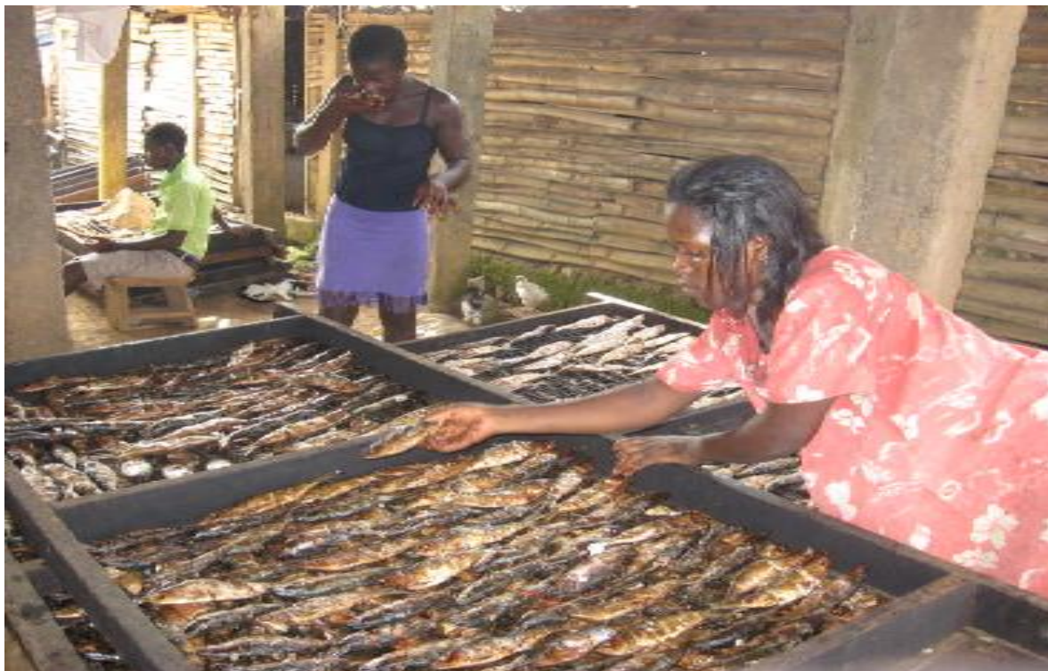
Figure 2.1: Turning time of smoked fish at the processing unit on chorkor kiln oven (Field visit, 2011).