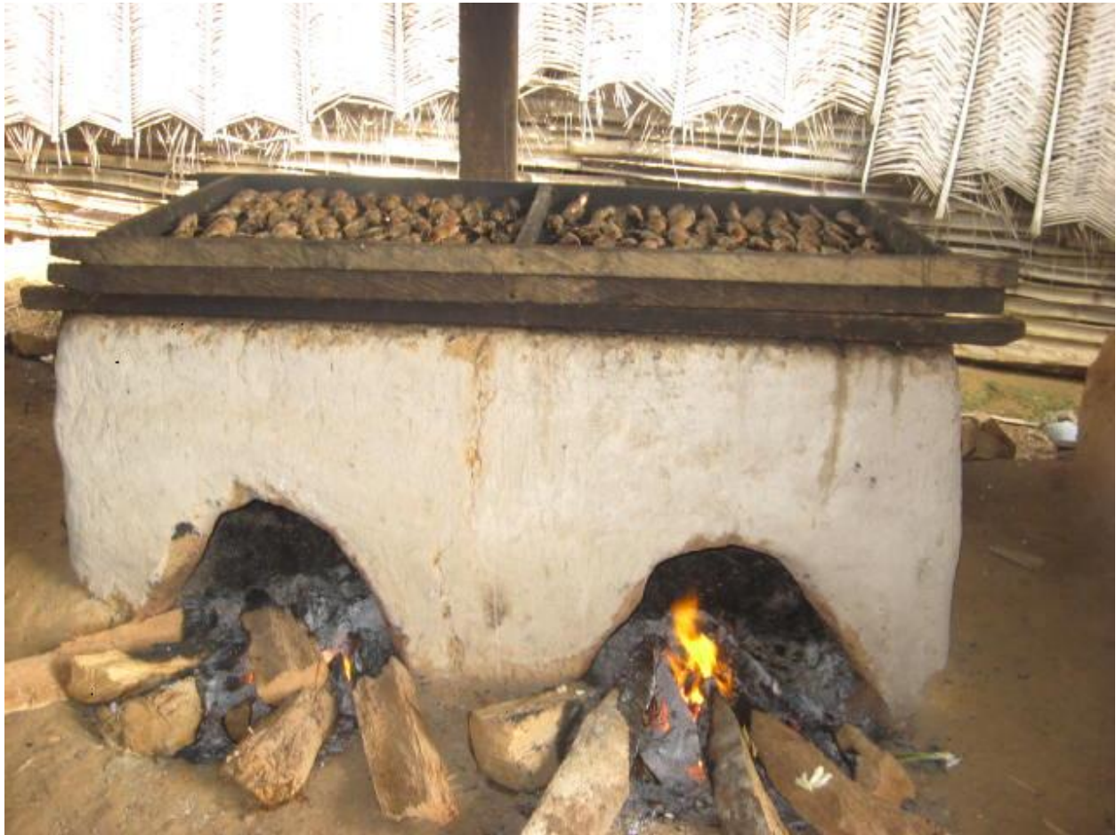
Figure 3. 1: Chorkor smoked oven with fish on tier trays for smoking (Field visit, 2011)