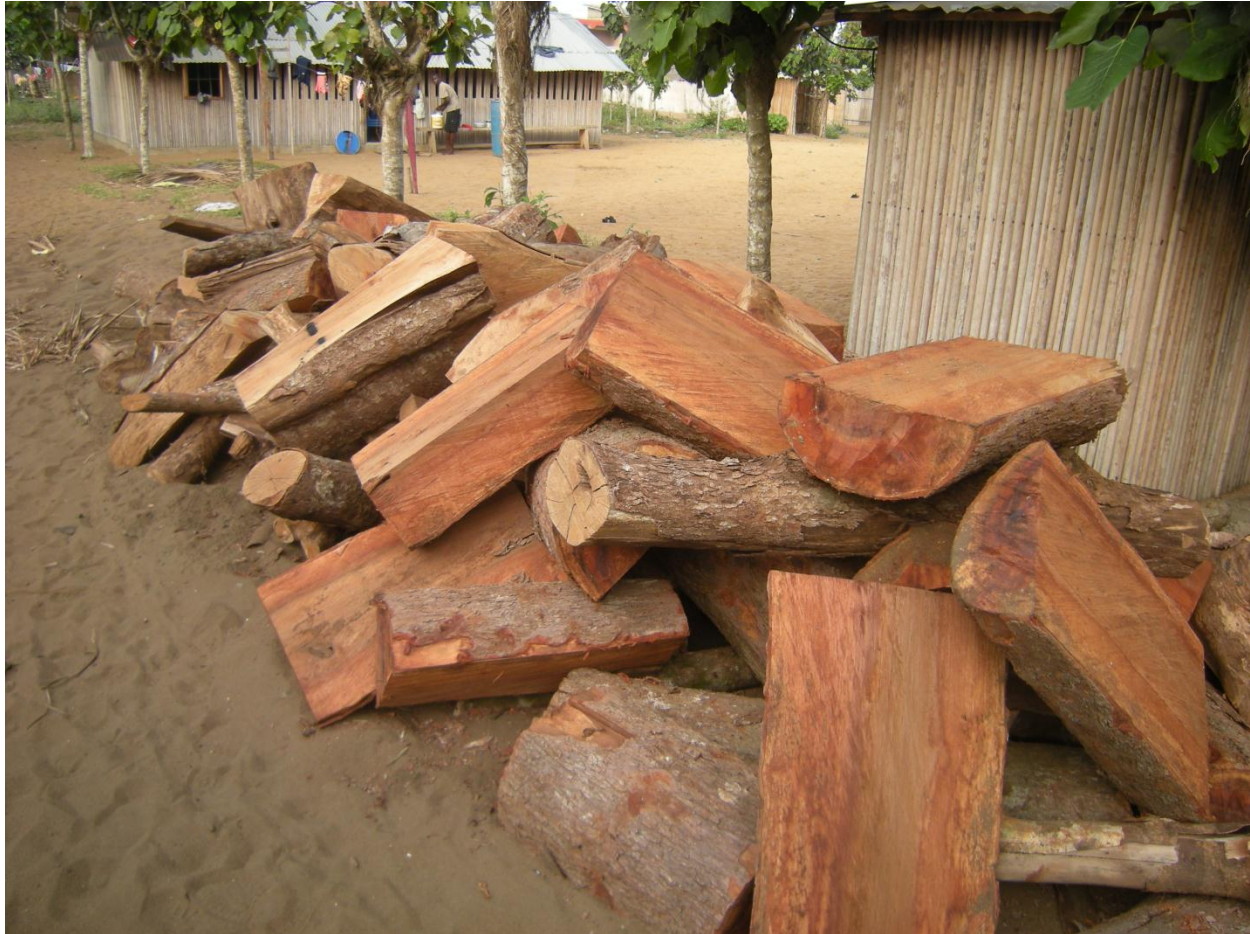
Figure 3.2: Heaps of mangrove fuel wood ready for fish smoking (field visit, 2012)

Through focus group discussions, the smoked fish processors specified that the types of fuel wood species used in the smoked fish that could produce the preferred smoked fish include the following as spelt out in Table 3.1.