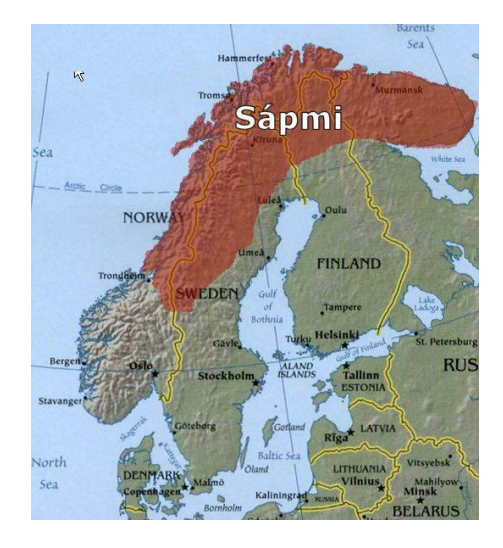
Figure 2: Traditional Sami land in Norway, Sweden, Finland and Russia (http://thedailygeographer.tumblr.com/)