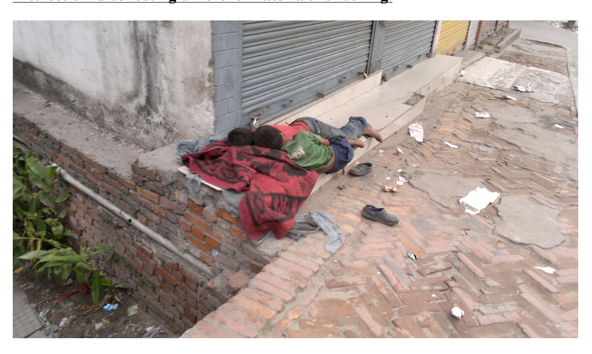
Street children sleeping infront of a shop