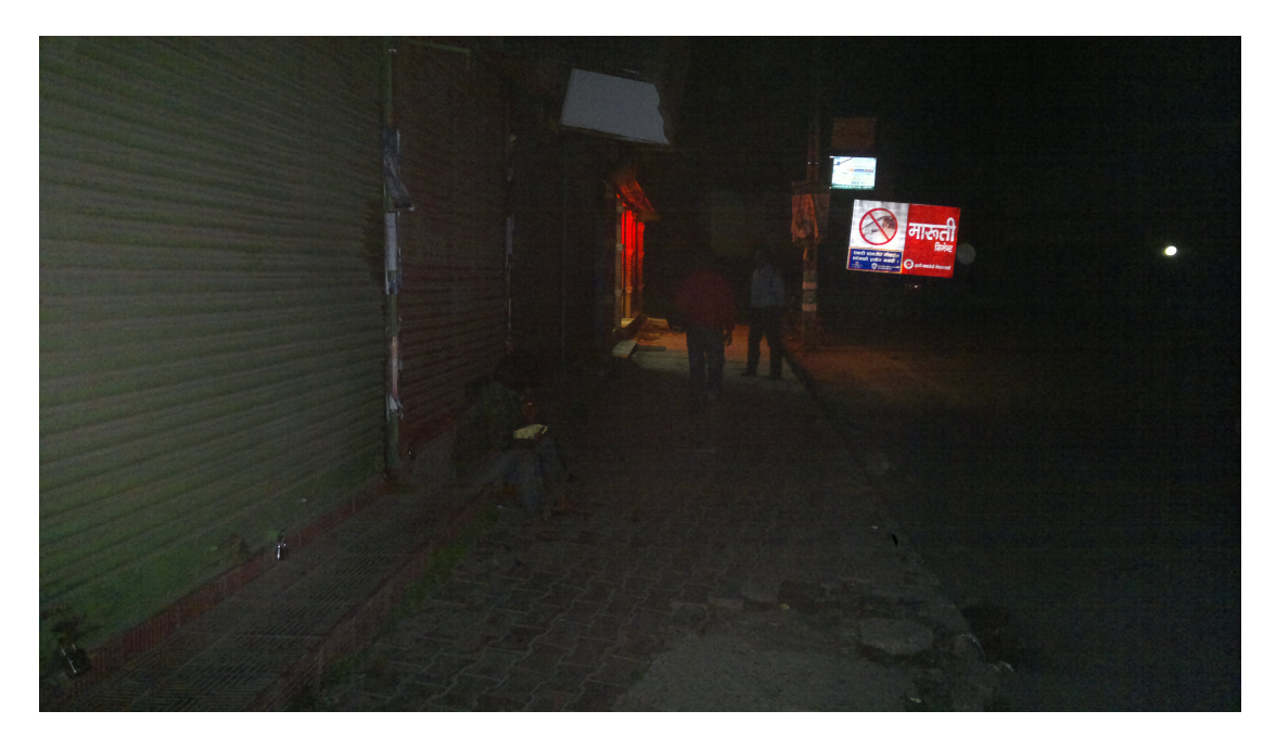
Street children during evening