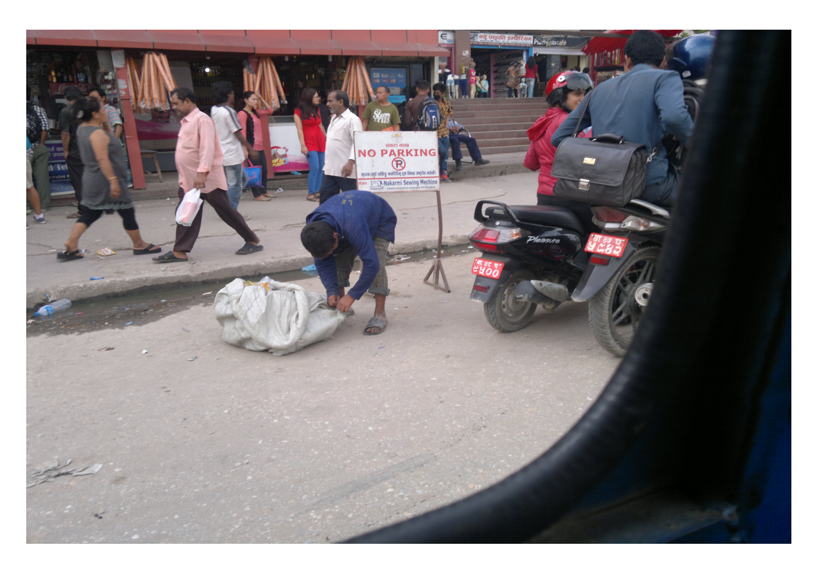
A street child collecting different materials for selling.