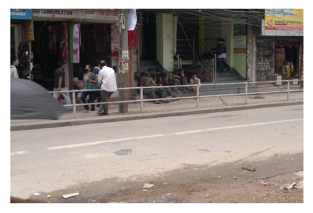
Street children in a group