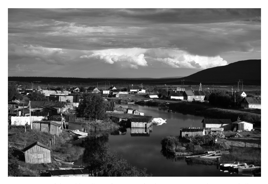
2007: Rests of the "old" village of Lovozero by the Virma river.