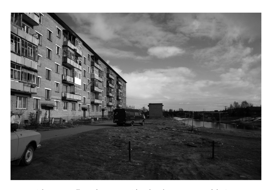
2007: The "new" village of Lovozero. After the relocations most of the Sami were settled in blocks of flats.