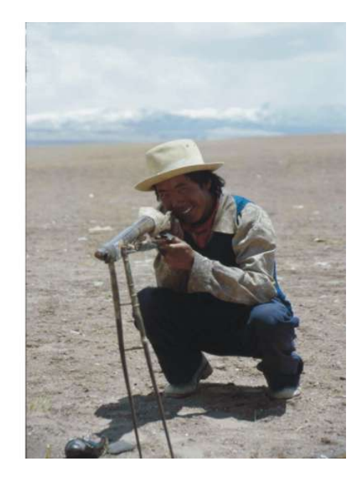
Fig. 2. Aru basin nomads demonstrating how to use a traditional leg-hold chiru trap, and an old Tibetan flintlock rifle.