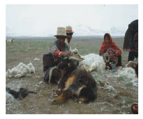
Fig. 3. Nomads comb the shedding cashmere wool from their goats in June every year.

Over the past decade the average price for cashmere wool has increased, but prices still fluctuate dramatically on a year-to-year basis. During the years 1990-1999 prices received by Aru nomads ranged from ¥65 to ¥170/jin, with such large differences often occurring from one year to the next (Table 3). The nomads have to sell all their cashmere production to the government, even though they would get better prices from private traders. In 1999, for example, the government paid ¥65/jin, while the price from the private traders was almost ¥20 higher. This had also been the case between 1993-1999, but in 2000 the government