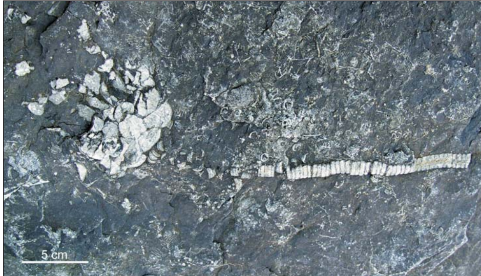
Fig. 3. Catacrinidae gen. et sp. indet. Posterior view of a slightly distorted specimen. ZPAL Ca. 9/A.1.

Description. — Cup low and bowl-shaped with a single, large, hexagonal anal. Basals trapezoid-shaped, convex, widely outflaring. Radials pentagonal, convex, outflaring. Proximal arms biserial, isotomously branching above two? uniserial and poorly visible primibrachials. Distal arms not preserved. Brachials chisel-shaped, round transversely. The homeomorphic and non-cirriferous stem composed of low columnals with convex latus. The articular facet flat and covered with numerous fine culmina. The lumen rather small, circular.