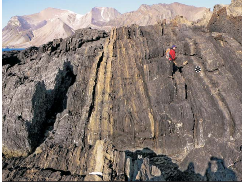
Fig. 2. Steeply dipping beds in the lower part of the Kapp Starostin Formation in the northern part of Akseløya. The catacrinid crinoid was collected in the horizon in front of the person (asterisk).