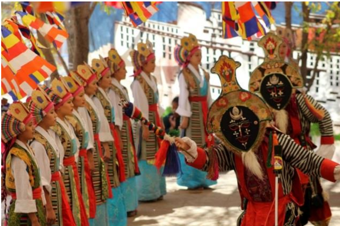
Tibetans have long-standing traditions in Performing Arts