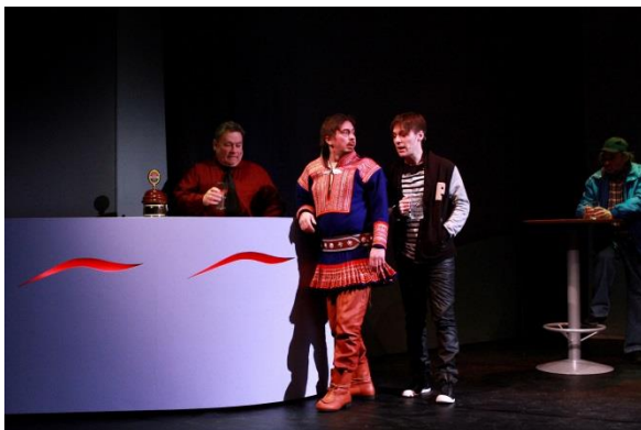
Beivváš has Sámi as stage language