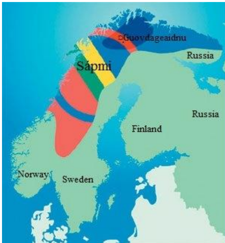
The Sámi people is divided by four borders