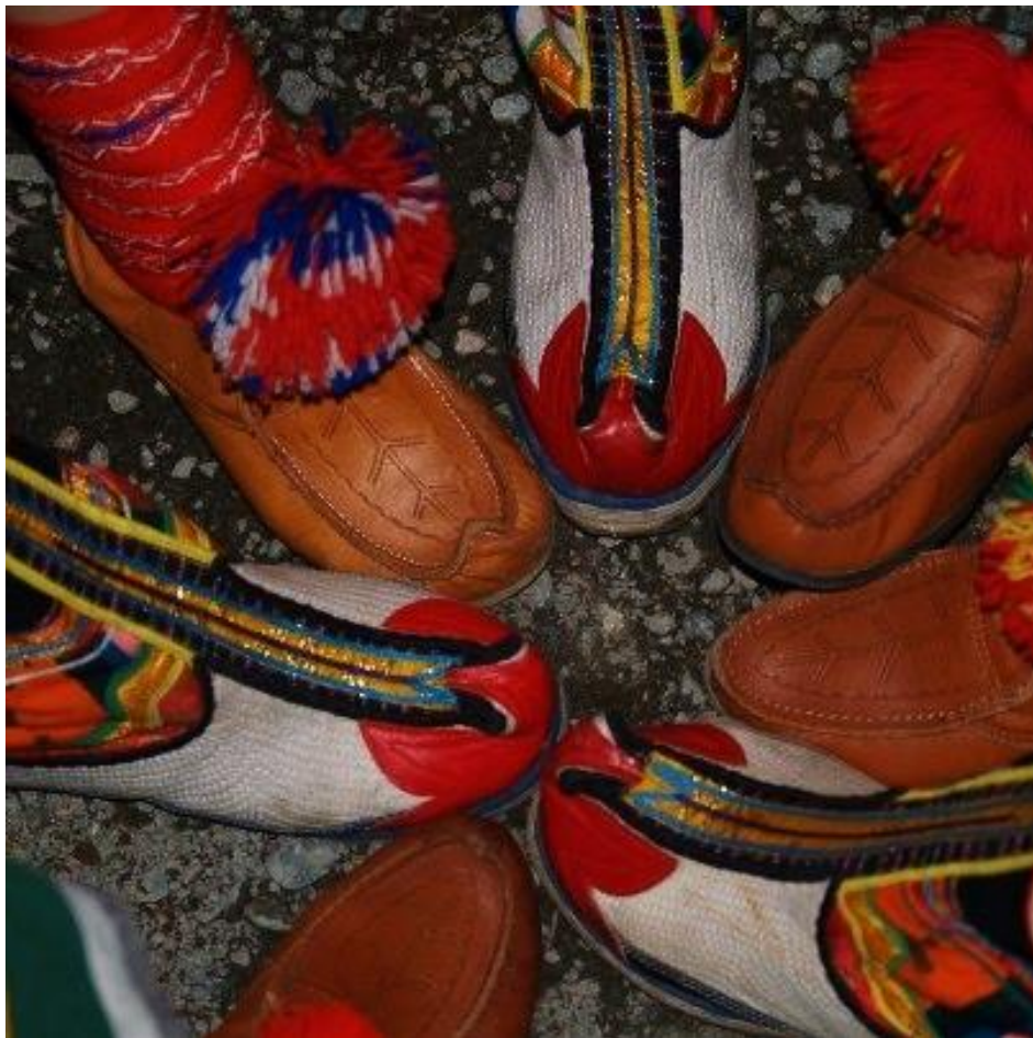
There are similarities between the Sámi and Tibetan cultures.