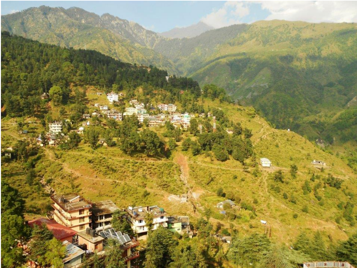
McLeod Ganj, The Tibetan settlement in Dharamshala, is located in the steep foothills of Himalaya, India.