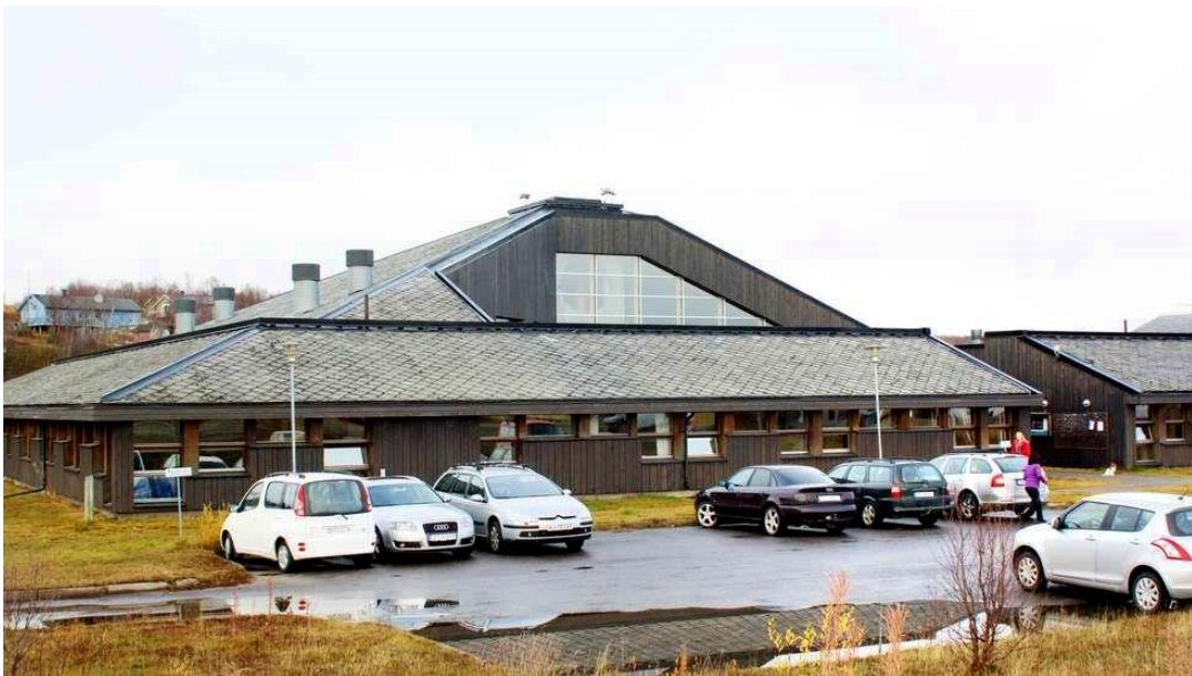
The Culture House of Guovdageaidnu is not suitable for theater in Beivváš scale and by today's standards.