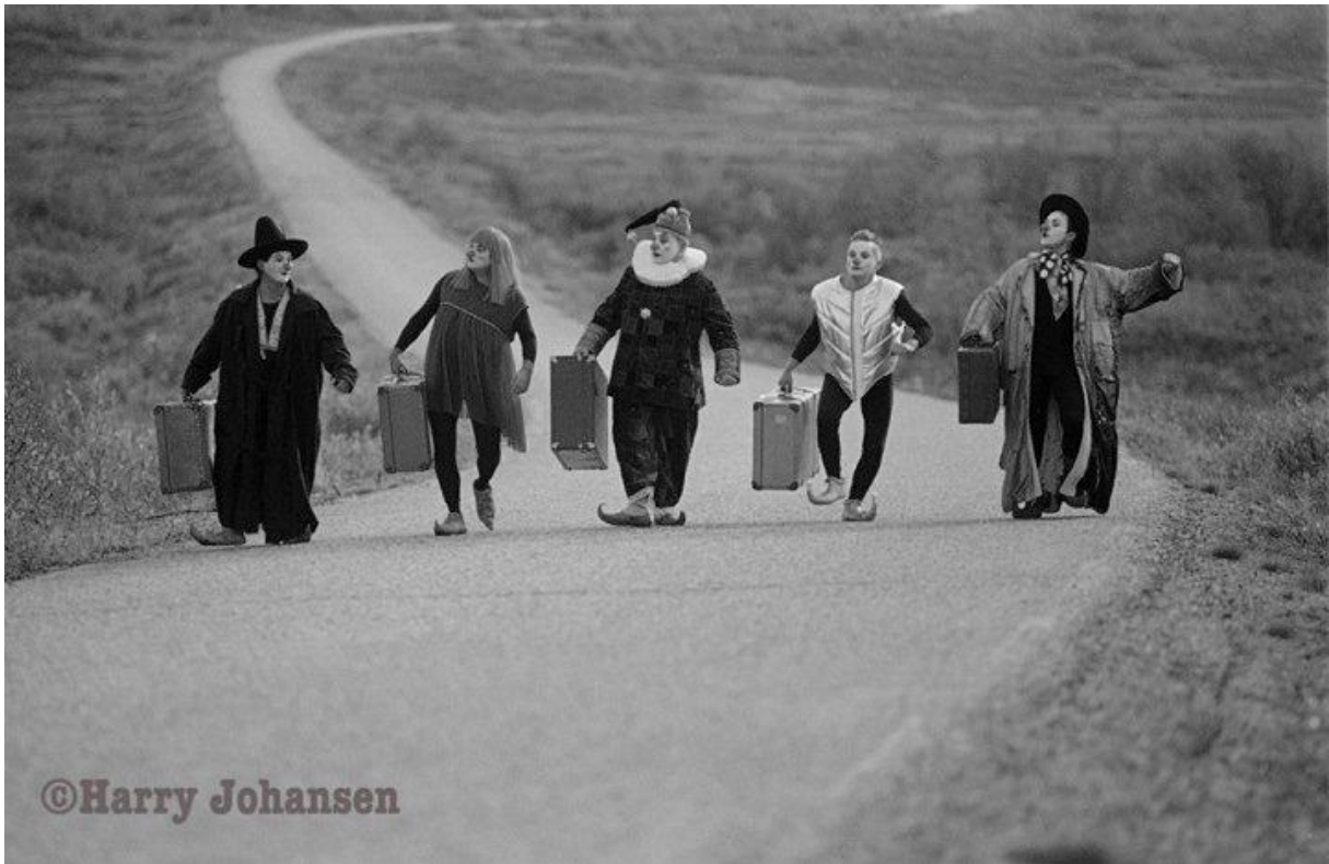
Theater dramatics from the Western world have been performed at Beivváš' stage for decades. Here from Shakespeare's Mac Beth in the clown version.