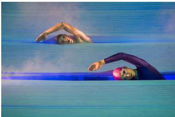
The Sámi theater is a mix between traditions and modernity.