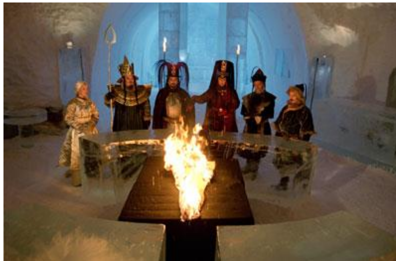
The performance Hamlet , at the Ice Globe Theater in Čohkkiras/Jukkasjärvi, Sweden 2003, (Photo: Harry Johansen)