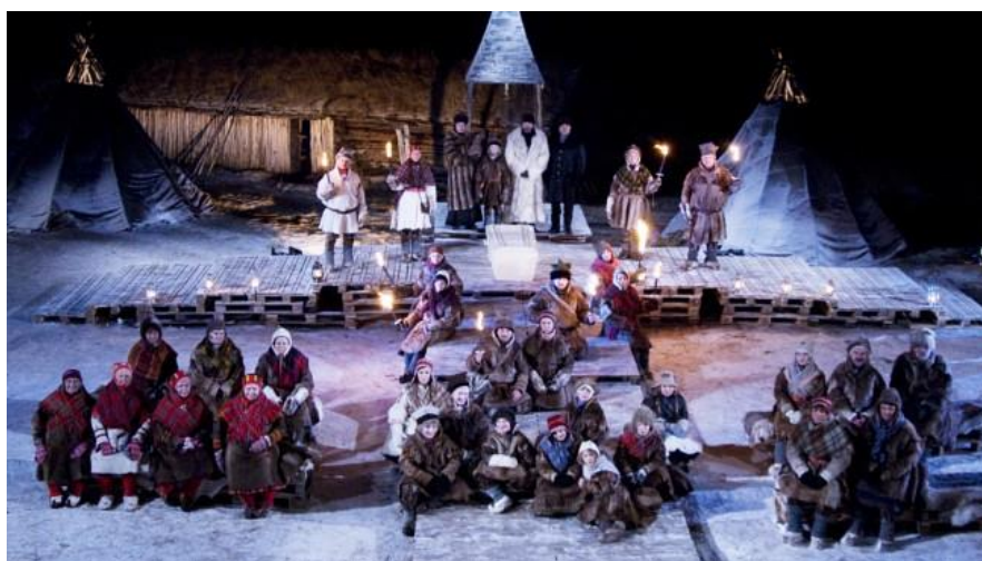
The outdoor performance 1852/Kautokeino Rebellions , 2008