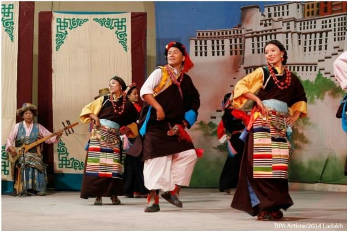
The interdisciplinary trained TIPA-students are important culture ambassadors for Tibet.