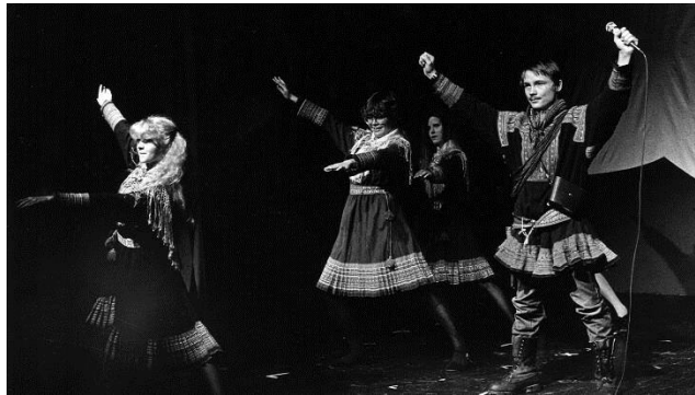
Beaivváš' first theater production Min duoddarat (Our highlands) 1981