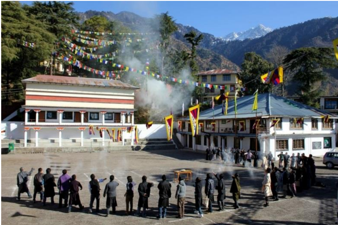
TIPA – a culture institution in exile