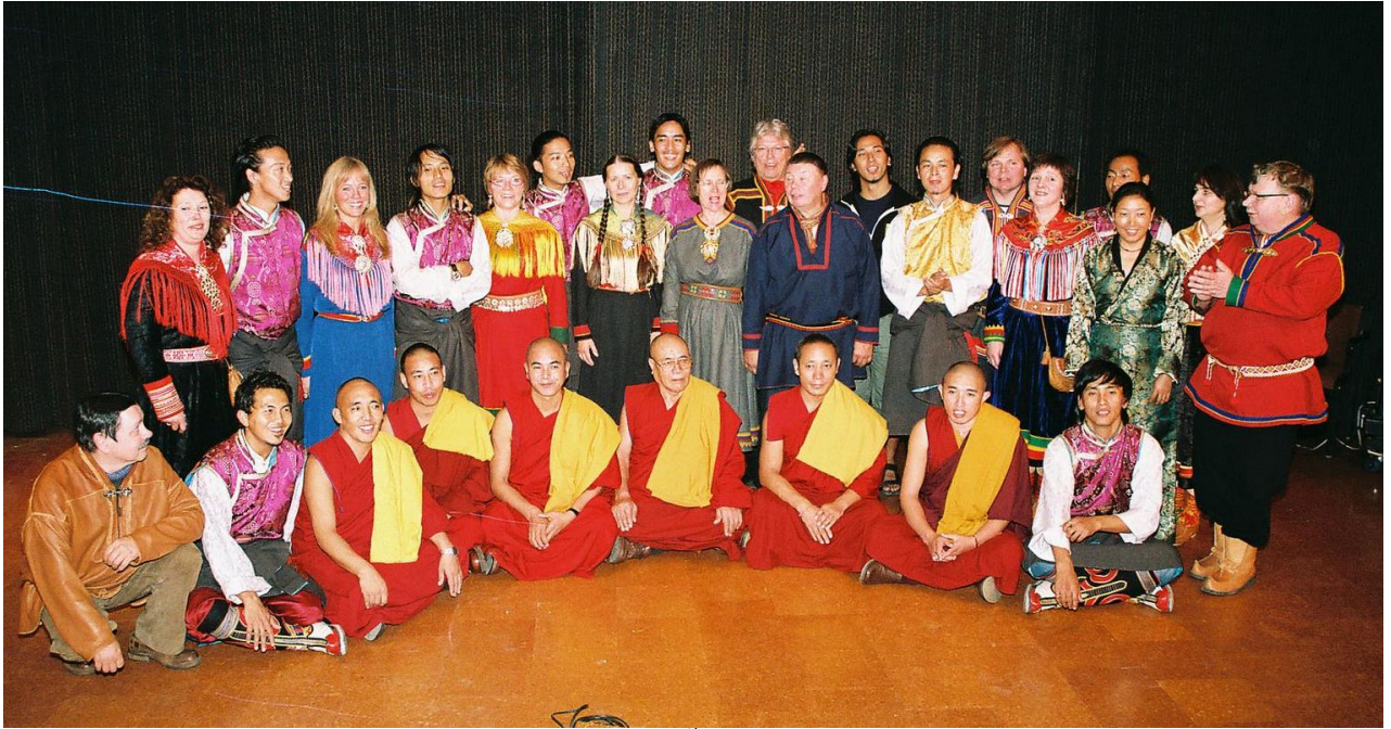
Sámi -Tibetan performance at Indigenous peoples Day 9 th August 2008 in Stockholm.