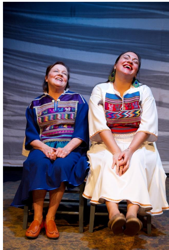
Theater where other indigenous cultures are presented.