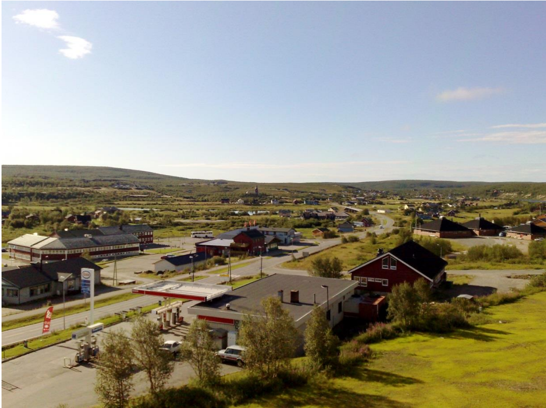
Guovdageaidnu – a culture and education center in Sápmi