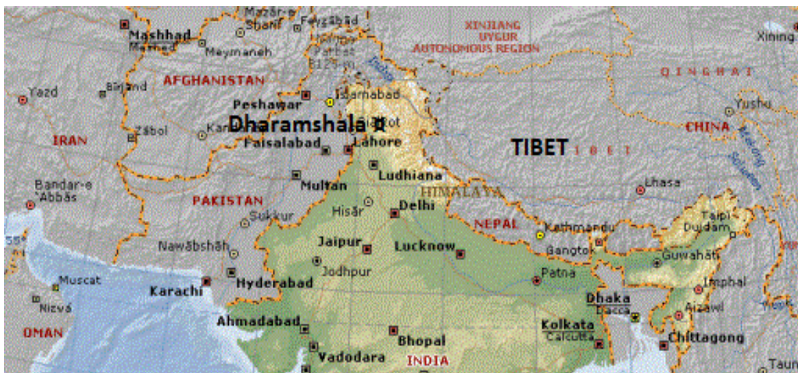
China, Tibet and India