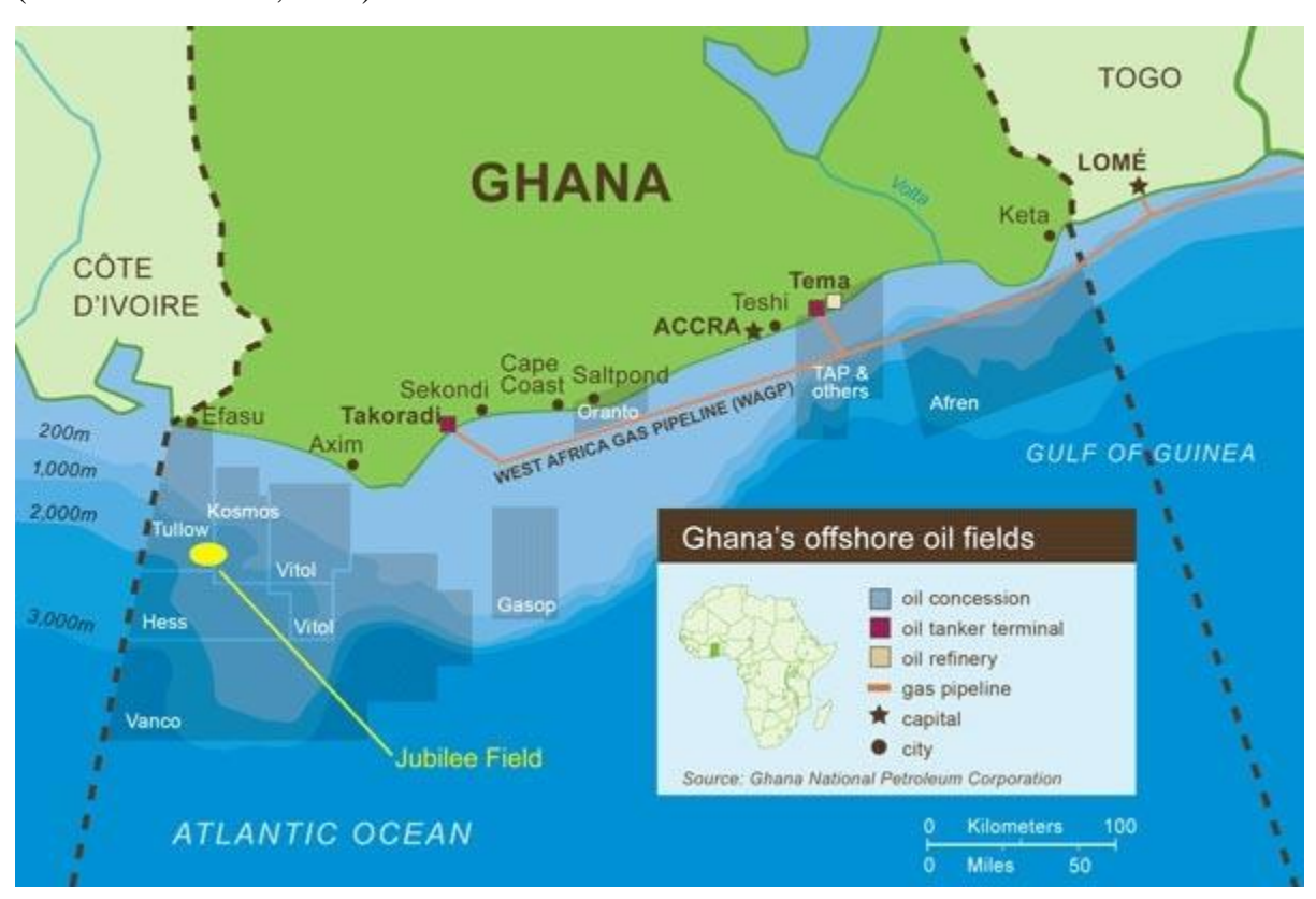
Fig 1. Map of Ghana showing some cities and location of oil fields including the Jubilee Field

At the end of 2006, Kosmos Energy signed a second agreement in Accra that gave it a long term lease rights in the offshore Deep water Tano Block adjacent to West Cape Three Points Block (McCaskie, 2008). This time Tullow took the lead with a 49.95%, Kosmos 18%, Anadarko 18%, Sabre 4.05% and GNPC 10% (ibid). Ghana's oil at its Jubilee Fields straddles two oil blocks in deep Atlantic waters off Ghana's western coast, approximately 63 kilometres (39 miles) from the coast and 132 kilometers (83 miles) southwest of Tarkoradi in the Western region(Gary, 2009; McCaskie, 2008).