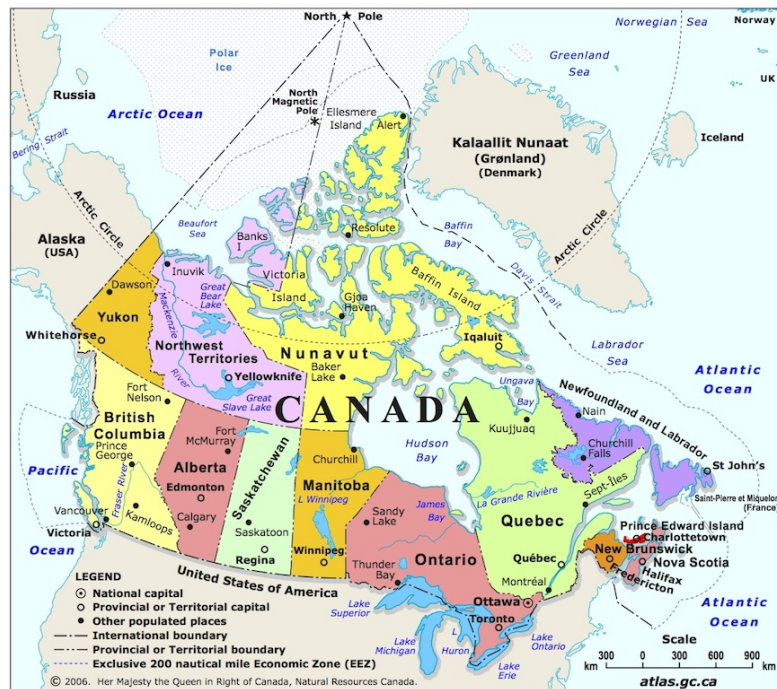
Figure 1.1: Map over Canada’s provinces and territories (Natural Resources Canada, 2006)