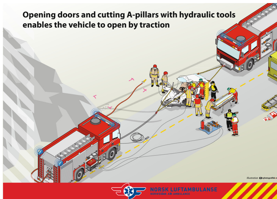
Figure 2 Rapid extrication technique.

Written consent was gathered. The Regional Committee for Medical and Health Research Ethics concluded that the project did not fall under the committee's mandate (2012/990 A). The Norwegian Social Science Data Service found that the study complied with the requirements of the Personal Data Act (project number 31025). Data were coded and analysed in Excel (Microsoft Corporation, USA) and STATA/SE 11.1 (Statacorp, USA). STROBE (STrengthening the Reporting of OBservational studies in Epidemiology) guidelines for observational research and the