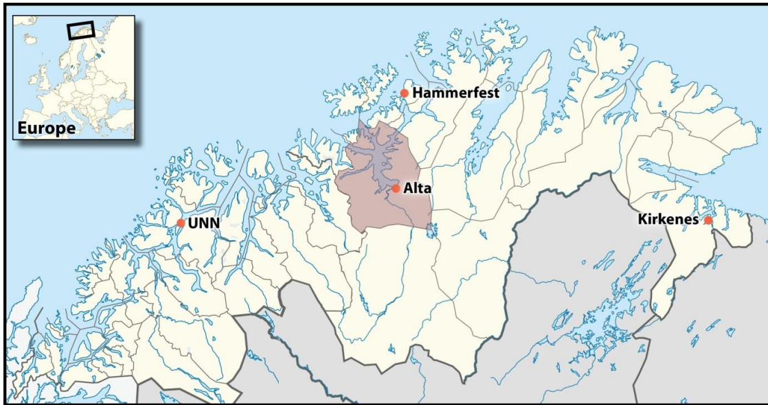
Figure 1. The air ambulance base in Alta, Finnmark, with the municipality of Alta shaded. The local hospitals in Hammerfest and Kirkenes as well as the University Hospital of Northern Norway in Tromsø (UNN) are marked. Straight line air distance between Alta and Hammerfest is 84 km, Tromsø 175 km, and Kirkenes 251 km.

Fixed-wing air ambulance services have been employed in Alta since the 1950s, initially using seaplanes. In 1988, a national air ambulance service was established, and since then, two ambulance aircraft have been deployed in Alta (Fig. 1); the current craft are two dual-engine Beach King Air 200/B200s. The flight nurses in the Norwegian National Air Ambulance Service are either specialist nurse anesthetists or intensive care nursing specialists. 6 In Alta, all nurses work on a rotational basis at the air ambulance base and in the intensive care or anesthesia department at the hospital in Hammerfest, respectively. Thus, they have competency and experience in emergency situations beyond that available in the municipality's emergency medical preparedness network. At the air ambulance base in Alta, the flight nurses have traditionally engaged in preparedness and cooperation in the local community with the municipality health care services. The flight nurses have been