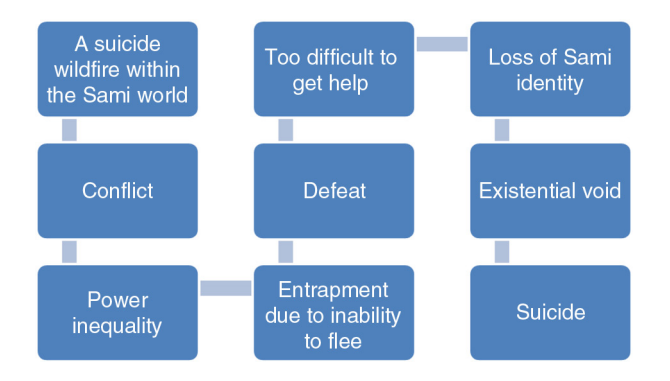
Fig. 1. Illustration of a prevailing narrative on suicide among Sami, as interpreted by the authors in relation to the results.

do not die by their own hand but from their inability to flee in face of death. That is, in this perspective, suicide is a consequence of the threats from majority society against the Sami culture. We argue that these converging meanings of identity and power in relation to suicide (as acts in a political context, yet within normality) make up a very problematic socio-cultural dynamic wherein engaging in suicidal behaviour, or even dying by suicide, can paradoxically strengthen Sami identity. To the extent that this narrative is part of the socio-cultural context in which struggling Sami individuals navigate their actions, those individuals might chose to engage in suicidal behaviour to be part of the social narrative placing them inside the Sami world rather than, for example, talk openly about their individual mental health issues (and risking experiencing oneself as disconnected from the Sami world due to breaking a cultural taboo). In Fig. 2, we seek to theoretically illustrate what socio-cultural processes (the outer circle) we believe might be underlying the themes that emerged in this study.