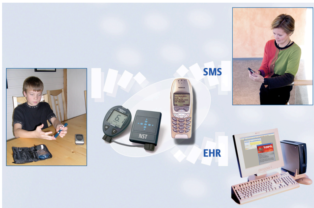
Figure 1: Automatic blood glucose data transfer to EHR and as an SMS to relatives.

capturing these data in their EHR. Instead, the patients are asked to remember their last measurements at their annual, bi-annual or quarterly visits. Thus, the most important parameter for avoiding diabetes complications is still not utilized in medical documents, neither for use by health care personnel nor for the patients or relatives. The same is true for the two other most important parameters for people with diabetes; nutrition and physical activity data. The latter two are hardly ever captured at any health institutions. Prescriptions of medicines and measurement equipment are still not generated or transferred automatically to pharmacies, but issued as a paper document from the doctor to the patient (often handwritten).