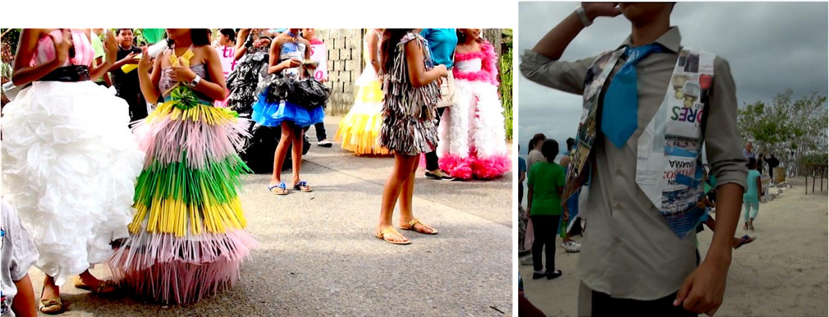
Figure 2: Images from Recycling parade, June 5 th 2015.