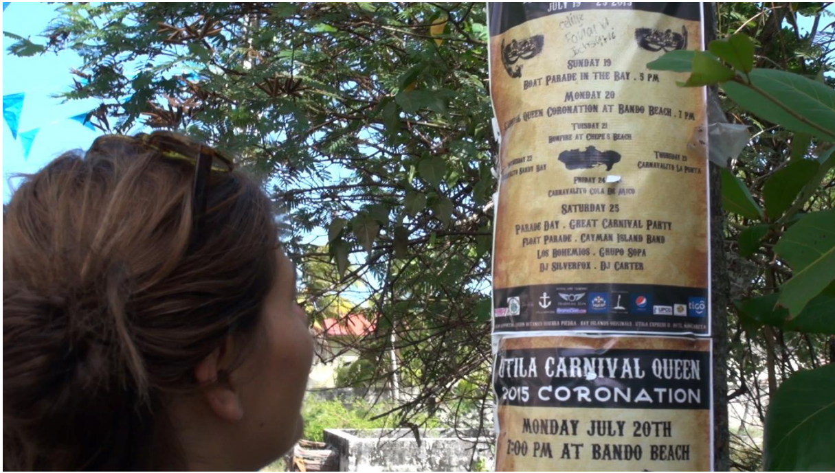
Figure 5: Carnival Posters on Utila main street.