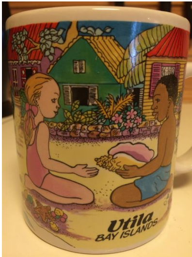
Figure 3: Specialty mug, sold at Utila Originals souvenir store, the only souvenir store on the island.