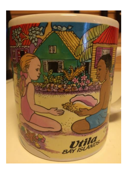
Figure 3: Specialty mug, sold at Utila Originals souvenir store, the only souvenir store on the island.