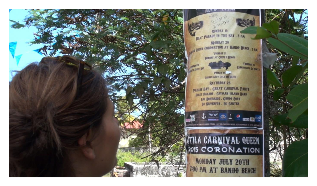
Figure 5: Carnival Posters on Utila main street.